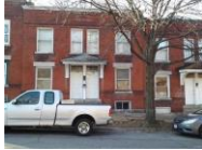
3118 Utah St, St. Louis, MO 63118 2-family, 1,980 sq. ft. - $58,000