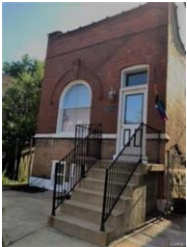
3243 Texas Ave, St. Louis, MO 63118 2 beds, 2 baths, 731 sq. ft. - $89,000