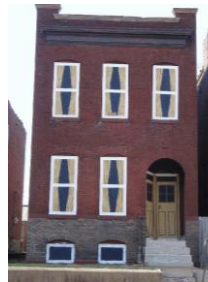
3104 Wyoming Street 2- family, 1,710 sq. ft. - $3,000

On most Fridays, we'll post properties for-sale in our neighborhood. If you have a property you'd like featured, let us know.