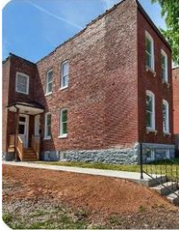
3139 Ohio Ave, St. Louis, MO 63118 3 beds, 2.5 baths, 1,696 sq. ft. - $135,000