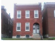
3437 Virginia Ave, St. Louis, MO 63118 2-family, 2,727 sq. ft. - $90,000