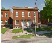
3306 Louisianan Ave, St. Louis, MO 63118 4-family, 3,196 sq. ft. - $99,500 NEW