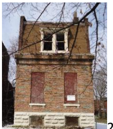
2831 S. Jefferson Ave Bed, bath, sq. ft. - $1,500