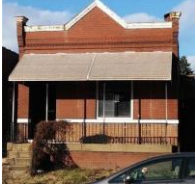
3011 Utah St, St. Louis, MO 63118 2 beds, 1 bath, 1,100 sq. ft. - $20,000