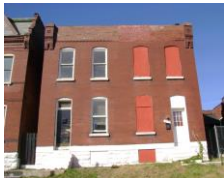
3175 Oregon Ave Half of 4-family conversion, 1,350 sq. ft.