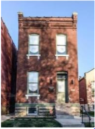
2922 Texas Ave, St. Louis, MO 63118 2 beds, 2.5 baths, 2,570 sq. ft. - $189,900