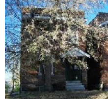
3181 Minnesota Ave 2-family, 1824 sq. ft. - $2,500