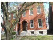
2917 Cherokee St, St. Louis, MO 63118 2-family, N/A sq. ft. - $53,000