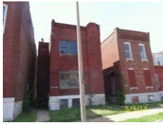
2929 California Ave Bed, bath, sq. ft. - $1,500