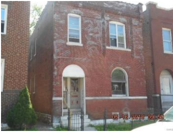
3230 Oregon Ave, 63118 2-family, sq. ft. - $39,500 NEW