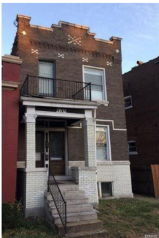
2832 Texas Ave, 63118 2-family, 1,938 sq. ft. - $64,900