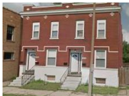
2806-2808 Iowa Ave, St. Louis, MO 63118 4-family, 3,600 sq. ft. - $132,500