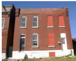
3175 Oregon Ave Half of 4-family conversion, 1,350 sq. ft. (OPTIONED)