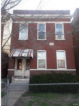
3236 Pennsylvania Ave, 63118 2-family, 2,156 sq. ft. - $64,900 (Pending)