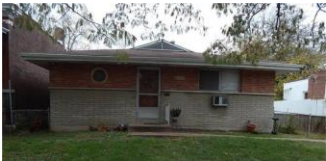
3172 Pennsylvania Ave, 63118 3-family, 1,800 sq. ft. - $109,900