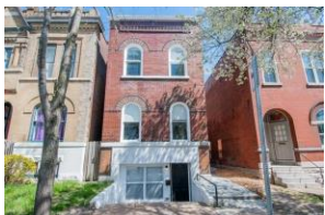
3405 Cherokee St, 63118 3-family, 3,165 sq. ft. - $225,000