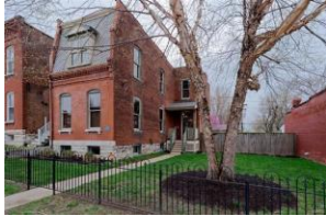
2817 Wyoming St, 63118 2 beds, 2.5 baths, 2,068 sq. ft. - $239,000 (Pending)