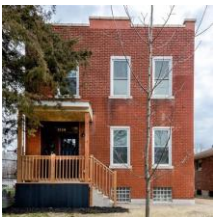
3134 Texas Ave, 63118 3 beds, 2.5 baths, 1,600 sq. ft. - $219,000 (Contingent)