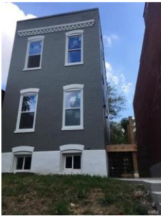
2909 Texas Ave, 63118 3 beds, 3 baths, 1,828 sq. ft. - $169,000 (Contingent)