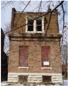
2831 S. Jefferson Ave Bed, bath, sq. ft. - $1,500