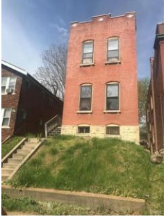
3159 Oregon Ave, 63118 3 beds, 1.5 baths, 1,582 sq. ft. - $65,000