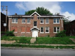
3209 Nebraska Ave 4-family, 2,970 sq. ft. - $6,000