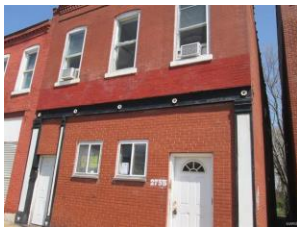
2755 Arsenal St, 63118 2-family, N/A sq. ft. - $62,000 (Foreclosure)