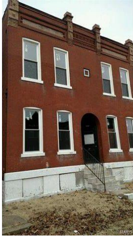
2639 Wyoming St, 63118 1,899 sq. ft. - $74,900 (Pending)

SEVERAL CDA AND LRA PROPERTIES LISTED HERE ARE NOW OPTIONED. WE'RE TRYING TO GET A LIST FROM THE CITY. THANK YOU FOR YOUR PATIENCE AND UNDERSTANDING.