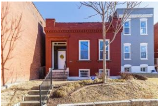
2904 Texas Ave, 63118 3 beds, 1 bath, 1,456 sq. ft. - $110,000 (Pending)