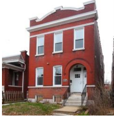
3307 Texas Ave, 63118 2-family, 2,204 sq. ft. - $179,000