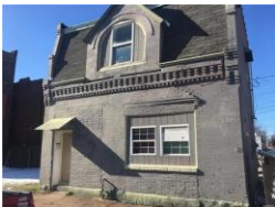
3165 Texas Ave, 63118 2 beds, 2 bath, 1,056 sq. ft. - $25,000 (Pending)