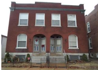
2704 Arsenal St, 63118 3-family, 2,033 sq. ft. - $159,000