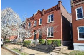
2641 Wyoming St, 63118 3 beds, 2.5 baths, 2,591 sq. ft. - $210,000 (Contingent)