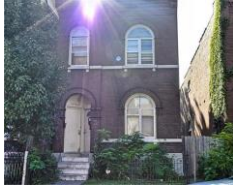
3266 Ohio Ave, St. Louis, MO 63118 2-family, 1,862 sq. ft. - $60,000 NEW