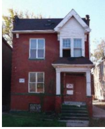
2750 Utah Street Bed, bath, sq. ft. - $3K

On most Fridays, we'll post properties for-sale in our neighborhood. If you have a property you'd like featured, let us know.