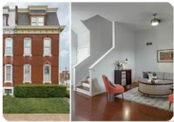
3129 Ohio Ave, St. Louis, MO 63118 3 beds, 2.5 baths, 2,358 sq. ft. - $189,000