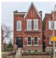
Wyoming St, St. Louis, MO 63118 3 beds, 2.5 baths, 3,276 sq. ft. - $269,900