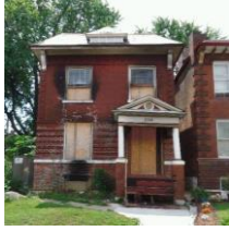
2746 Utah Street 2-family, 1472 sq. ft. - $1,500