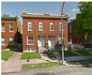
3306 Louisianan Ave, St. Louis, MO 63118 4-family, 3,196 sq. ft. - $99,500