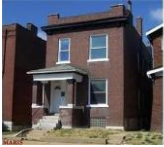
3109 Wyoming St, St. Louis, MO 63118 3 beds, 2 baths, 1,824 sq. ft. - $74,900