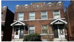
2857 Texas Ave, St. Louis, MO 63118 4-family, N/A sq. ft. - $92,500