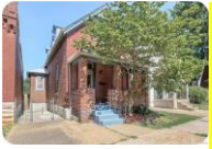
3251 Minnesota Ave, St. Louis, MO 63118 2 beds, 1.5 baths, 1,429 sq. ft. - $100,000