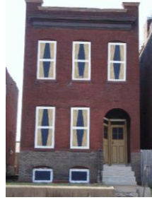
3104 Wyoming Street 2- family, 1,710 sq. ft. - $3,000