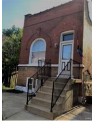
3243 Texas Ave, St. Louis, MO 63118 2 beds, 2 baths, 731 sq. ft. - $89,000