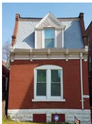
2807 Wyoming St, St. Louis, MO 63118 2 beds, 2 bath, 1,292 sq. ft. - $119,900