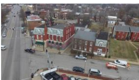
2800 Ohio Ave, St. Louis, MO 63118 Seven Properties Package - $949,000