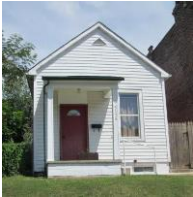
3174 Nebraska Ave, St. Louis, MO 63118 2 beds, 1 bath, NA sq. ft. - $44,000