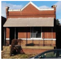
3011 Utah St, St. Louis, MO 63118 2 beds, 1 bath, 1,100 sq. ft. - $20,000