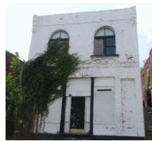
2704 Utah Street Mixed use, 3,500 sq. ft. - Appraisal Only