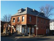
3133 Cherokee St, St. Louis, MO 63118 Mixed Use, 3,790 sq. ft. - $120,000