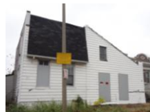
2716 Utah Street 2 Beds, 1 bath, 1,020 sq. ft. - $1,500