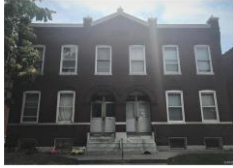
3166 Oregon Ave, St. Louis, MO 63118 4-family, 5,198 sq. ft. - $170,000 NEW