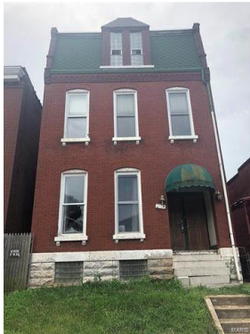
3108 Wyoming St, 63118 5 beds, 2.5 baths, 2,728 sq. ft. - $145,000 NEW