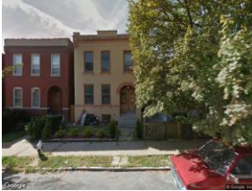
3329 Michigan Ave, 63118 beds, 2 baths, 2,408 sq. ft. - $152,000 NEW