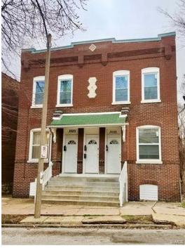
3020 Texas Ave, 63118 4-family, 3,162 sq. ft. - $150,000 (Pending)