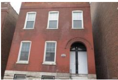
2752 Wyoming St, 63118 2-family, N/A sq. ft. - $159,900

SEVERAL CDA AND LRA PROPERTIES LISTED HERE ARE NOW OPTIONED. WE'RE TRYING TO GET A LIST FROM THE CITY. THANK YOU FOR YOUR PATIENCE AND UNDERSTANDING.