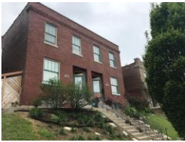
3224 Michigan Ave, 63118 3 beds, 2.5 baths, 2,050 sq. ft. - $199,500