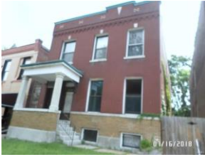
3304 Texas Ave, 63118 2-family, 3,134 sq. ft. - $18,700 (Pending)