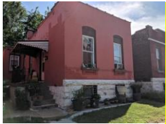
2818 Utah St, 63118 1 bed, 2 bath, 796 sq. ft. - $35,000 NEW