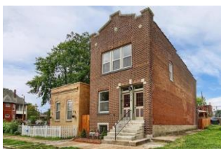
2829 Iowa Ave, 63118 3 beds, 2.5 baths, 1,996 sq. ft. - $229,000 (Pending)