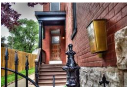
3239 Ohio Ave, 63118 2 beds, 1.5 baths, 1,842 sq. ft. - $235,000