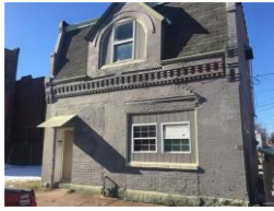
3165 Texas Ave, 63118 2 beds, 2 bath, 1,056 sq. ft. - $50,000