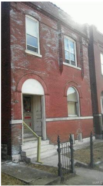
3230 Oregon Ave, 63118 2-family, 2,272 sq. ft. - $46,000