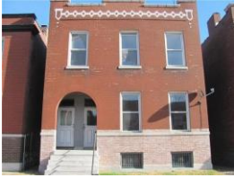
3242 Nebraska Ave, 63118 2-family, 2,808 sq. ft. - $43,900