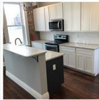
3148 Texas Ave, 63118 3 beds, 2 baths, 1,824 sq. ft. - $199,000