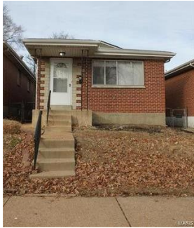
3217 Potomac St, 63118 2 beds, 1 bath, 874 sq. ft. - $47,900 NEW