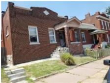
3315 Texas Ave, St. Louis, MO 63118 2 beds, ` bath, 950 sq. ft. - $50,000