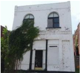
2704 Utah Street Mixed use, 3,500 sq. ft. – Appraisal Only