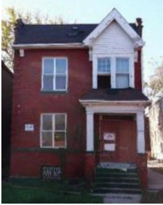
2750 Utah Street Bed, bath, sq. ft. - $3K