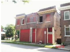
3302 California Ave Mixed Use, 3354 sq. ft. – Appraisal Only