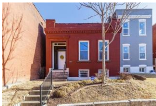
2904 Texas Ave, 63118 3 beds, 1 bath, 1,456 sq. ft. - $115,000