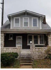
3416 Virginia Ave, 63118 2 beds, 1 bath, 816 sq. ft. - $29,900