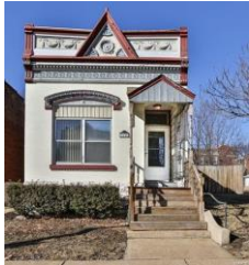
3149 Ohio Ave, 63118 2 beds, 1 bath, 907 sq. ft. - $100,000