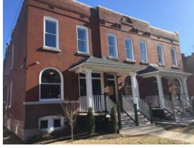
3000 Texas Ave, 63118 3 beds, 2 baths, 1,652 sq. ft. - $117,000 NEW