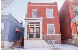
3334 Michigan Ave, 63118 3 beds, 2.5 baths, 1,784 sq. ft. - $194,900