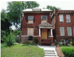
2746 Utah Street 2-family, 1472 sq. ft. - $1,500