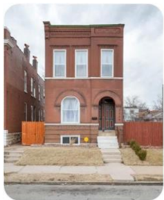
3329 Texas Ave, 63118 3 beds, 2 baths, 2,098 sq. ft. - $185,000 NEW