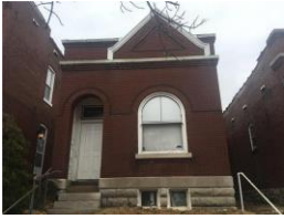
2909 Wyoming St, 63118 1 bed, 1 bath, 813 sq. ft. - $34,000