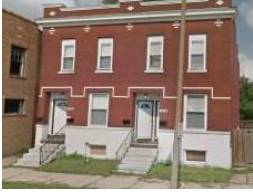
2806-2808 Iowa Ave, St. Louis, MO 63118 4-family, 3,600 sq. ft. - $132,500