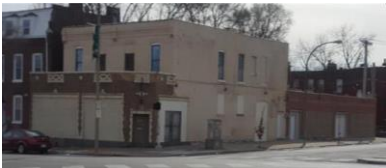
3424-3426 Cherokee St, 63118 Mixed Use, 10,040 sq. ft. - $90,000