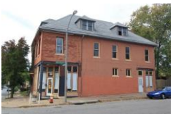
3133 Cherokee St, St. Louis, MO 63118 Mixed Use, 3,790 sq. ft. - $115,000