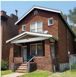
3107 Wyoming St, St. Louis, MO 63118 2-family, 2,090 sq. ft. - $70,000

SEVERAL CDA AND LRA PROPERTIES LISTED HERE ARE NOW OPTIONED. WE'RE TRYING TO GET A LIST FROM THE CITY. THANK YOU FOR YOUR PATIENCE AND UNDERSTANDING.