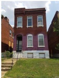
3326 Oregon Ave, St. Louis, MO 63118 2 beds, 1 bath, 3,254 sq. ft. - $50,000