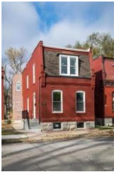
3169 Iowa Ave, St. Louis, MO 63118 3 beds, 1.5 baths, sq. ft. - $134,900