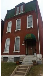
3108 Wyoming St, St. Louis, MO 63118 2-family, 2,728 sq. ft. - $60,000