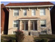
3338 Virginia Ave, St. Louis, MO 63118 4 family, 3,536 sq. ft. $ 127,750