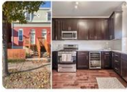
3425 S. Compton Ave, St. Louis, MO 63118 3 beds, 1.5 baths, 1,598 sq. ft. - $119,900