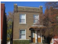
3341 Virginia Ave, St. Louis, MO 63118 2-family, 2,014 sq. Ft. - $89,750