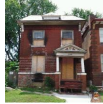
2746 Utah Street 2-family, 1472 sq. ft. - $1,500