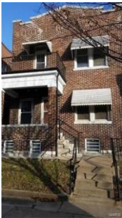
3330 Michigan Ave, St. Louis, MO 63118 2-family, 2,250 sq. ft. - $74,000