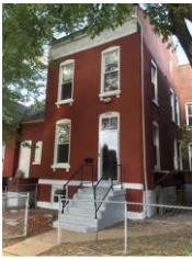
3100 Block Iowa Ave, St. Louis, MO 63118 3 beds, 3 baths, 1,774 sq. ft. - $128,500