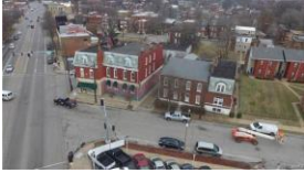
2800 Ohio Ave, St. Louis, MO 63118 Seven Properties Package - $1,100,000