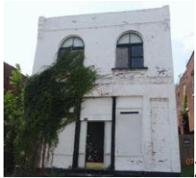
2704 Utah Street Mixed use, 3,500 sq. ft. – Appraisal Only