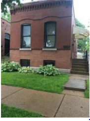
3330 S. Compton Ave, St. Louis, MO 63118 1 bed, 1 bath, 867 sq. ft. - $45,000