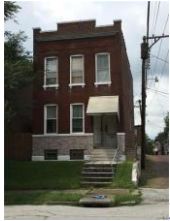
3217 Michigan Ave, St. Louis, MO 63118 2-family, 1,812 sq. ft. - $39,900