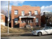
3230 Minnesota Ave, St. Louis, MO 63118 4-family, N/A sq. ft. - $160,000