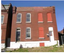
3175 Oregon Ave Half of 4-family conversion, 1,350 sq. ft.