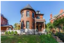
3147 S. Jefferson Ave, St. Louis, MO 63118 4 beds, 3 baths, 3,158 sq. ft. - $384,999