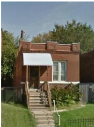
3340 Michigan Ave, St. Louis, MO 63118 2 beds, 1 bath, 835 sq. ft. - $20,000