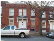
3118 Utah St, St. Louis, MO 63118 2-family, 1,980 sq. ft. - $58,000