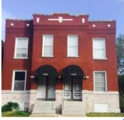
3246 Nebraska Ave, St. Louis, MO 63118 4-family, 4,046 sq. ft. - $139,000