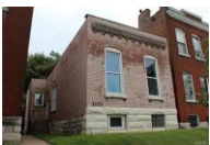
3173 Nebraska Ave, St. Louis, MO 63118 1 bed, 1 bath, 1,044 sq. ft. - $90,000