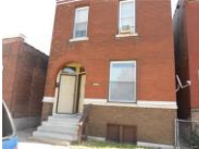
2824 Iowa Ave, St. Louis, MO 63118 2-family, 2,066 sq. ft. - $85,900