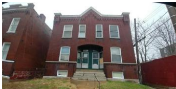
3020 Iowa Ave, 63118 4-family, 3,216 sq. ft. - $29,900