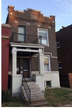
2832 Texas Ave, 63118 2-family, 1,938 sq. ft. - $79,900