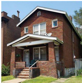
3107 Wyoming St, St. Louis, MO 63118 2-family, 2,090 sq. ft. - $70,000

SEVERAL CDA AND LRA PROPERTIES LISTED HERE ARE NOW OPTIONED. WE'RE TRYING TO GET A LIST FROM THE CITY. THANK YOU FOR YOUR PATIENCE AND UNDERSTANDING.