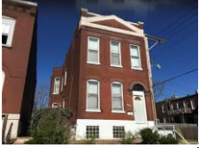
3215 Texas Ave, St. Louis, MO 63118 2 beds, 2 baths, 1,994 sq. ft. - $50,500 (Pending)