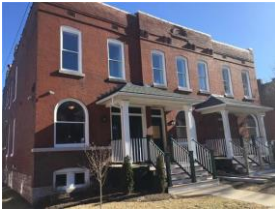
3000 Texas Ave, 63118 3 beds, 2 baths, 1,652 sq. ft. - $117,000 (Contingent)