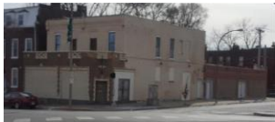
3424-3426 Cherokee St, 63118 Mixed Use, 10,040 sq. ft. - $90,000 (Pending)