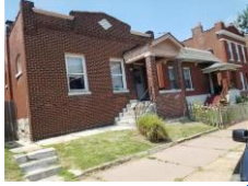
3315 Texas Ave, St. Louis, MO 63118 2 beds, 1 bath, 950 sq. ft. - $50,000