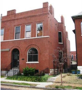
2647 Wyoming St, 63118 3 beds, 2.5 baths, 2,432 sq. ft. - $249,900 (Contingent)