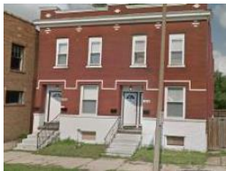
2806-2808 Iowa Ave, St. Louis, MO 63118 4-family, 3,600 sq. ft. - $132,500