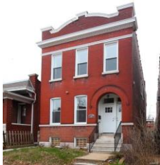
3307 Texas Ave, 63118 2-family, 2,204 sq. ft. - $179,000 NEW