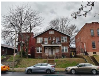
3161 Oregon Ave, 63118 4-family, 2,706 sq. ft. - $79,900 NEW