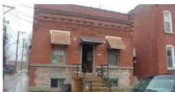
3343 Louisiana Ave, 63118 2-family, 1,500 sq. ft. - $29,900 (Pending)