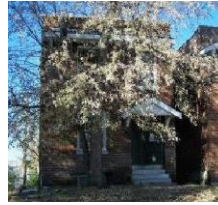
3181 Minnesota Ave 2-family, 1824 sq. ft. - $2,500