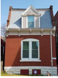
2807 Wyoming St, St. Louis, MO 63118 2 beds, 2 bath, 1,292 sq. ft. - $119,900