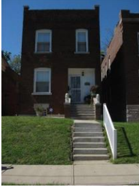
3443 Louisiana Ave, St. Louis, MO 63118 3 beds, 2 baths, 1,776 sq. ft. - $75,000