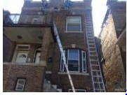
3230 Michigan Ave, St. Louis, MO 63118 2-family, 2,310 sq. ft. - $69,000