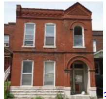
3229 Pennsylvania Ave 2-family, 1320 sq. ft. - $3,000