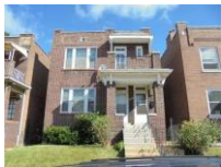
3025 Utah St, St. Louis, MO 63118 2-family, 2,162 sq. ft. - $87,000