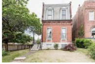
3133 Oregon Ave, St. Louis, MO 63118 3 beds, 1.5 baths, 1,800 sq. ft. - $145,000