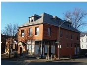
3133 Cherokee St, St. Louis, MO 63118 Mixed Use, 3,790 sq. ft. - $120,000