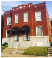
3246 Nebraska Ave, St. Louis, MO 63118 4-family, 4,046 sq. ft. - $139,000