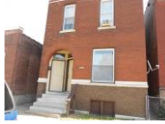
2824 Iowa Ave, St. Louis, MO 63118 2-family 2,066 sq. ft. - $79,900 NEW