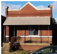
3011 Utah St, St. Louis, MO 63118 2 beds, 1 bath, 1,100 sq. ft. - $20,000