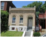
3167 Nebraska Ave, St. Louis, MO 63118 1 bed, 1 bath, 1,056 sq. ft. - $23,500 NEW