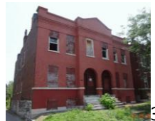
3214 Pennsylvania Ave 4-family, 4,640 sq. ft. - $6,000