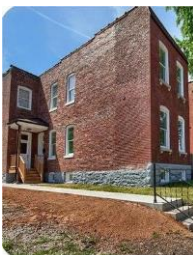
3139 Ohio Ave, St. Louis, MO 63118 3 beds, 2.5 baths, 1,696 sq. ft. - $135,000