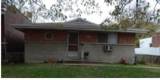
3172 Pennsylvania Ave, 63118 3-family, 1,800 sq. ft. - $115,000