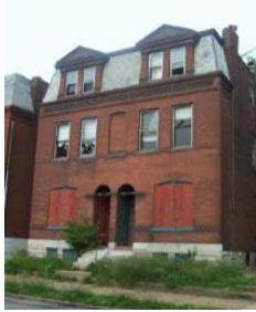
3135 California Ave 4-family, 5370 sq. ft. - $6,000 (OPTIONED)