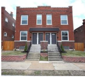
3424 Virginia Ave, 63118 3 beds, 2.5 baths, 1,820 sq. ft. - $199,900 (Contingent)