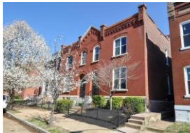
2641 Wyoming St, 63118 3 beds, 2.5 baths, 2,591 sq. ft. - $210,000 NEW