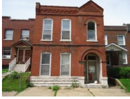
3229 Pennsylvania Ave 2-family, 1320 sq. ft. - $3,000