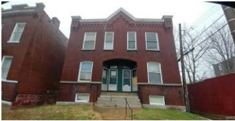
3020 Iowa Ave, 63118 4-family, 3,216 sq. ft. - $29,900