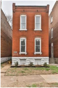
3011 Texas Ave, 63118 3 beds, 2baths, 1,512 sq. ft. $109,900