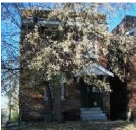
3181 Minnesota Ave 2-family, 1824 sq. ft. - $2,500