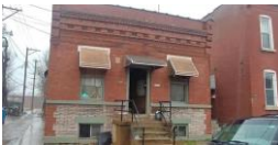
3343 Louisiana Ave, 63118 2-family, 1,500 sq. ft. - $29,900 (Pending)