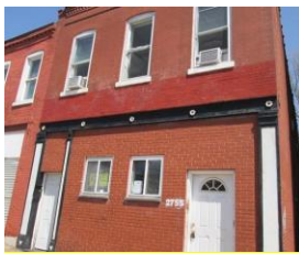
2755 Arsenal St, 63118 2-family, N/A sq. ft. - $62,000 NEW (Foreclosure)