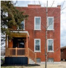
3134 Texas Ave, 63118 3 beds, 2.5 baths, 1,600 sq. ft. - $219,000 (Contingent)