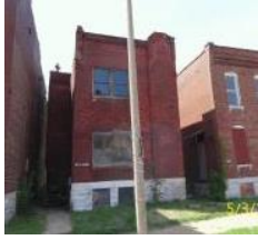
2929 California Ave Bed, bath, sq. ft. - $1,500