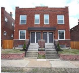
3426 Virginia Ave, 63118 3 beds, 2.5 baths, 1,820 sq. ft. - $199,900 (Contingent)