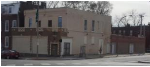
3424-3426 Cherokee St, 63118 Mixed Use, 10,040 sq. ft. - $90,000 (Pending)