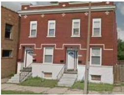
2806-2808 Iowa Ave, St. Louis, MO 63118 4-family, 3,600 sq. ft. - $132,500