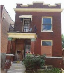
3324 Louisiana Ave Single family, 2,028 sq. ft. - $3,000