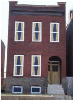
3104 Wyoming Street 2-family, 1,710 sq. ft. - $3,000

On most Fridays, we'll post properties for-sale in our neighborhood. If you have a property you'd like featured, let us know.