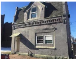
3165 Texas Ave, 63118 2 beds, 2 bath, 1,056 sq. ft. - $25,000