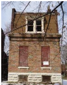
2831 S. Jefferson Ave Bed, bath, sq. ft. - $1,500