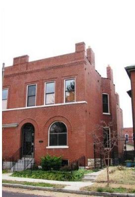
2647 Wyoming St, 63118 3 beds, 2.5 baths, 2,432 sq. ft. - $249,900 (Contingent)