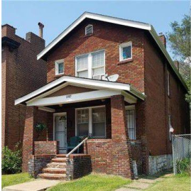
3107 Wyoming St, St. Louis, MO 63118 2-family, 2,090 sq. ft. - $70,000

SEVERAL CDA AND LRA PROPERTIES LISTED HERE ARE NOW OPTIONED. WE'RE TRYING TO GET A LIST FROM THE CITY. THANK YOU FOR YOUR PATIENCE AND UNDERSTANDING.