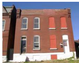
3175 Oregon Ave Half of 4-family conversion, 1,350 sq. ft. (OPTIONED)