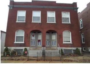
2704 Arsenal St, 63118 3-family, 2,033 sq. ft. - $159,000