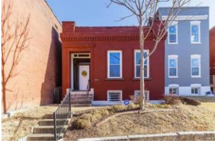
2904 Texas Ave, 63118 3 beds, 1 bath, 1,456 sq. ft. - $110,000