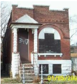
3417 Louisiana Ave Single family, 816 sq. ft.

Visit the CDA site for information on purchasing. Those with (NSP) by the listing are a part of the Neighborhood Stabilization Program fund. Vacant lots not listed below.