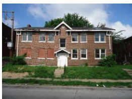
3209 Nebraska Ave 4-family, 2,970 sq. ft. - $6,000