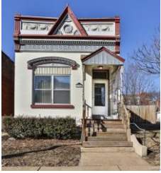
3149 Ohio Ave, 63118 2 beds, 1 bath, 907 sq. ft. - $90,000