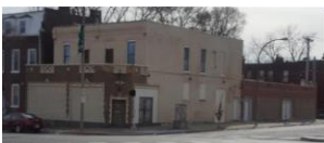
3424-3426 Cherokee St, 63118 Mixed Use, 10,040 sq. ft. - $90,000 (Pending)