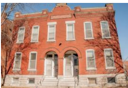
2911 Cherokee St, 63118 4-family, 5,590 sq. ft. - $294,900 (Pending)