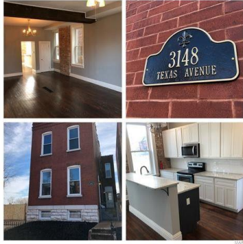
3148 Texas Ave, 63118 3 beds, 2 baths, 1,824 sq. ft. - $199,000 (Pending)