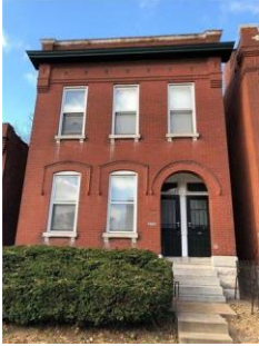
3233 Oregon Ave, 63118 2-family, 2,430 sq. ft. - $74,900 (Pending)