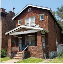
3107 Wyoming St, St. Louis, MO 63118 2-family, 2,090 sq. ft. - $70,000

SEVERAL CDA AND LRA PROPERTIES LISTED HERE ARE NOW OPTIONED. WE'RE TRYING TO GET A LIST FROM THE CITY. THANK YOU FOR YOUR PATIENCE AND UNDERSTANDING.