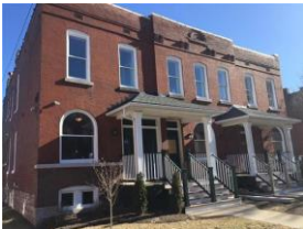
3000 Texas Ave, 63118 3 beds, 2 baths, 1,652 sq. ft. - $117,000 (Pending)

Open House: Sunday, March 18 from 1-3 pm