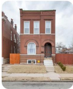
3329 Texas Ave, 63118 3 beds, 2 baths, 2,098 sq. ft. - $185,000 (Pending)