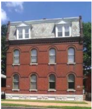
3124 Oregon Ave, St. Louis, MO 63118 4-family, 4,719 sq. ft. - $149,000