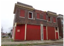
3302 California Ave Mixed Use, 3354 sq. ft. – Appraisal Only