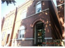
3223 Oregon Ave, St. Louis, MO 63118 2-family, 2,250 sq. ft. - $29,900