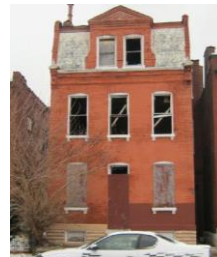
3330 Iowa Ave Bed, bath, square feet - $1,500