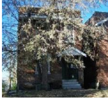
3181 Minnesota Ave 2-family, 1824 sq. ft. - $2,500