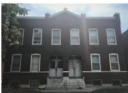
3166 Oregon Ave, St. Louis, MO 63118 4-family, 5,198 sq. ft. - $159,000