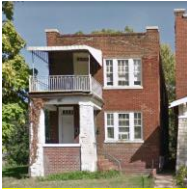
3160 Nebraska Ave, St. Louis, MO 63118 2-family, 1,830 sq. ft. - $32,500 NEW