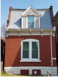
2807 Wyoming St, St. Louis, MO 63118 2 beds, 2 bath, 1,292 sq. ft. - $109,900