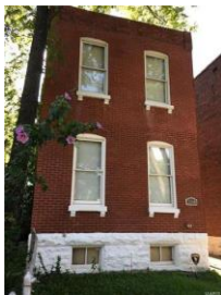
3160 Ohio Ave, St. Louis, MO 63118 3 beds, 2.5 baths, 1,546 sq. ft. - $164,000