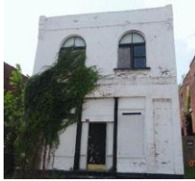
2704 Utah Street Mixed use, 3,500 sq. ft. – Appraisal Only