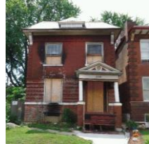
2746 Utah Street 2-family, 1472 sq. ft. - $1,500