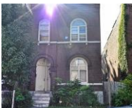
3230 Ohio Ave, St. Louis, MO 63118 2-family, 1,862 sq. ft. - $59,500