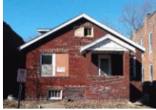
3021 Texas Ave Single family, 1,400 sq. ft. (NSP)