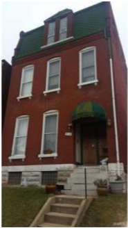
3108 Wyoming St, St. Louis, MO 63118 4 beds, 3.5 baths, 2,728 sq. ft. - $47,000