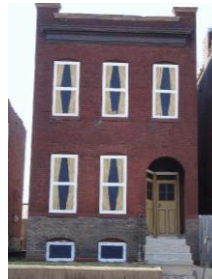
3104 Wyoming Street 2- family, 1,710 sq. ft. - $3,000

On most Fridays, we'll post properties for-sale in our neighborhood. If you have a property you'd like featured, let us know.