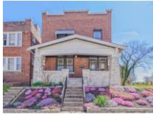
3162 Nebraska Ave, St. Louis, MO 63118 3 beds, 2 baths, 2,650 sq. ft. - $173,900