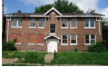
3209 Nebraska Ave 4-family, 2,970 sq. ft. - $6,000