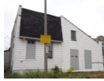
2716 Utah Street 2 Beds, 1 bath, 1,020 sq. ft. - $1,500