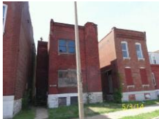
2929 California Ave Bed, bath, sq. ft. - $1,500

*Most will be total gut rehabs; vacant lots not listed.