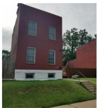
3176 Nebraska Ave, St. Louis, MO 63118 2 beds, 1.5 baths, 1,172 sq. ft. - $90,000