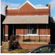
3011 Utah St, St. Louis, MO 63118 2 beds, 1 bath, 1,100 sq. ft. - $20,000