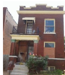
3324 Louisiana Ave Single family, 2,028 sq. ft. - $3,000