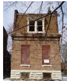
2831 S. Jefferson Ave Bed, bath, sq. ft. - $1,500