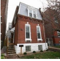
3129 Oregon Ave, St. Louis, MO 63118 2 beds, 2 baths, 2,875 sq. ft. - $139,800