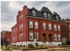
2626 Wyoming St, St. Louis, MO 63118 5-family, 6,956 sq. ft. - $500,000