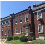
3253 Texas Ave, St. Louis, MO 63118 3 beds, 1.5 baths, 1,536 sq. ft. - $42,000