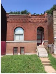
3241 Oregon Ave, St. Louis, MO 63118 1 bed, 2 baths, 836 sq. ft. - $52,500