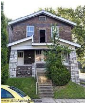
3260 Michigan Ave, St. Louis, MO 63118 2-family, 2,400 sq. ft. - $56,500