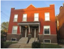
3343 Virginia Ave, St. Louis, MO 63118 4-family, 3,744 sq. ft. - $145,000