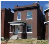
3109 Wyoming St, St. Louis, MO 63118 3 beds, 2 baths, 1,824 sq. ft. - $74,900