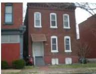
2621 Arsenal St, St. Louis, MO 63118 2-family, 2,378 sq. ft. - $105,000