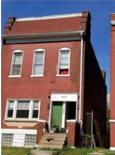
3253 Oregon Ave, St. Louis, MO 63118 2-family, 2,318 sq. ft. - $57,900 NEW