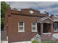
3315 Texas Ave, St. Louis, MO 63118 2 beds, 1 bath, 950 sq. ft. - $50,000 NEW