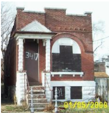
3417 Louisiana Ave Single family, 816 sq. ft.

Visit the CDA site for information on purchasing. Those with (NSP) by the listing are a part of the Neighborhood Stabilization Program fund. Vacant lots not listed below.