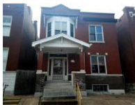
3240 Nebraska Ave, St. Louis, MO 63118 3 beds, 1.5 baths, 1,790 sq. ft. - $43,000