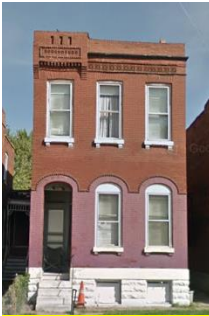
3326 Oregon Ave, St. Louis, MO 63118 2 beds, 1 bath, 3,254 sq. ft. - $50,000 NEW