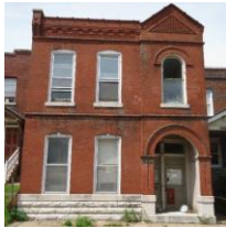
3229 Pennsylvania Ave 2- family, 1320 sq. ft. - $3,000