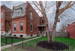
2817 Wyoming St, 63118 2 beds, 2.5 baths, 2,068 sq. ft. - $239,000 NEW