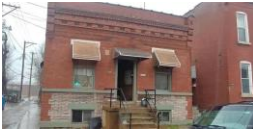
3343 Louisiana Ave, 63118 2-family, 1,500 sq. ft. - $29,900 (Pending)