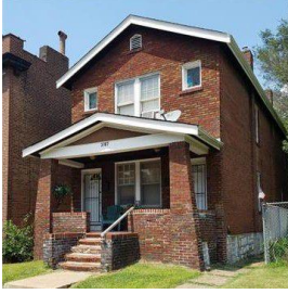
3107 Wyoming St, St. Louis, MO 63118 2-family, 2,090 sq. ft. - $70,000

SEVERAL CDA AND LRA PROPERTIES LISTED HERE ARE NOW OPTIONED. WE'RE TRYING TO GET A LIST FROM THE CITY. THANK YOU FOR YOUR PATIENCE AND UNDERSTANDING.