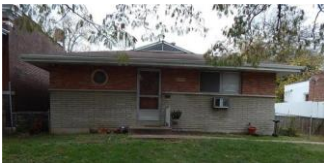
3172 Pennsylvania Ave, 63118 3-family, 1,800 sq. ft. - $115,000