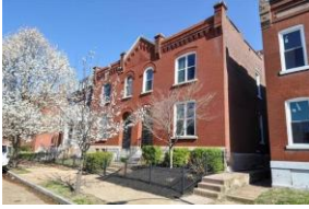
2641 Wyoming St, 63118 3 beds, 2.5 baths, 2,591 sq. ft. - $210,000