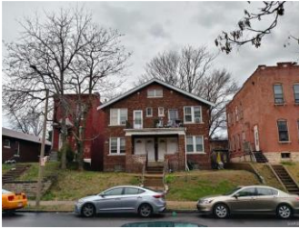
3161 Oregon Ave, 63118 4-family, 2,706 sq. ft. - $79,900