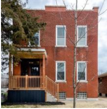
3134 Texas Ave, 63118 3 beds, 2.5 baths, 1,600 sq. ft. - $219,000 (Contingent)