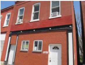
2755 Arsenal St, 63118 2-family, N/A sq. ft. - $62,000 (Foreclosure)