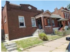
3315 Texas Ave, St. Louis, MO 63118 2 beds, 1 bath, 950 sq. ft. - $50,000 (Pending)