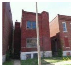
2929 California Ave Bed, bath, sq. ft. - $1,500

*Most will be total gut rehabs; vacant lots not listed.