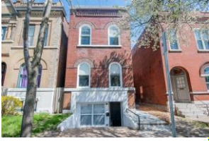
3405 Cherokee St, 63118 3-family, 3,165 sq. ft. - $225,000 NEW