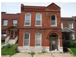
3229 Pennsylvania Ave 2-family, 1320 sq. ft. - $3,000