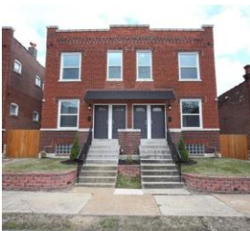
3426 Virginia Ave, 63118 3 beds, 2.5 baths, 1,820 sq. ft. - $199,900 (Contingent)