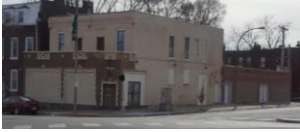
3424-3426 Cherokee St, 63118 Mixed Use, 10,040 sq. ft. - $90,000 (Pending)