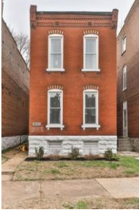
3011 Texas Ave, 63118 3 beds, 2baths, 1,512 sq. ft. $109,900 (Contingent)