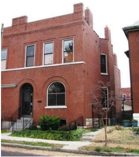
2647 Wyoming St, 63118 3 beds, 2.5 baths, 2,432 sq. ft. - $249,900 (Contingent)