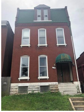
3108 Wyoming St, 63118 5 beds, 2.5 baths, 2,728 sq. ft. - $145,000