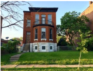
2919 Wyoming St, 63118 4 beds, 2 baths, 1776 sq. ft. - $55,000 NEW