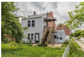
3129 California Ave, 63118 4 beds, 2 baths, 1,560 sq. ft. - $44,888 (Contingent)