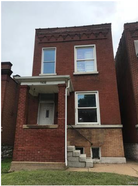
3430 Virginia Ave, 63118 3 beds, 1 bath, 1,632 sq. ft. - $89,900 NEW