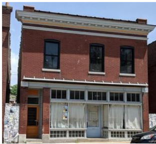
3151 Cherokee St, 63118 Mixed Use, 2,974 sq. ft. - $250,000 (Pending)