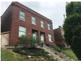
3224 Michigan Ave, 63118 3 beds, 2.5 baths, 2,050 sq. ft. - $199,500