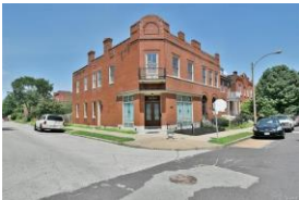
2649 Wyoming St, 63118 3 beds, 2.5 baths, 2,880 sq. ft. - $279,900 (Contingent)