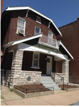
3149 Pennsylvania Ave, 63118 2-family, 2,268 sq. ft. - $99,000 NEW