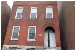
2752 Wyoming St, 63118 2-family, N/A sq. ft. - $159,900 (Pending)