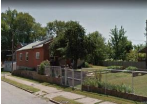
3144 Oregon Ave, 63118 1 bed, 1 bath, 999 sq. ft. - $34,888 (Contingent)