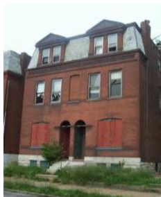
3135 California Ave 4-family, 5370 sq. ft. - $6,000 (OPTIONED)