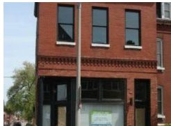
2757 Wyoming St, 63118 Mixed Use, 2,700 sq. ft. - $299,000 NEW

SEVERAL CDA AND LRA PROPERTIES LISTED HERE ARE NOW OPTIONED. WE'RE TRYING TO GET A LIST FROM THE CITY. THANK YOU FOR YOUR PATIENCE AND UNDERSTANDING.