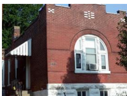
3159 California Ave, 63118 1 bed, 1 bath, 813 sq. ft. - $49,900