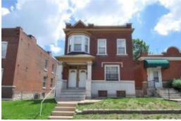
3450 Tennessee Ave, 63118 2-family, 2,162 sq. ft. - $128,900 (Pending)