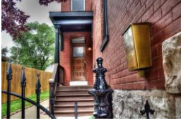
3239 Ohio Ave, 63118 2 beds, 1.5 baths, 1,842 sq. ft. - $235,000