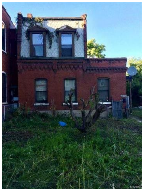
2801 Arsenal St, 63118 4 beds, 2 baths, 2,156 sq. ft. - $100,000 (Pending)