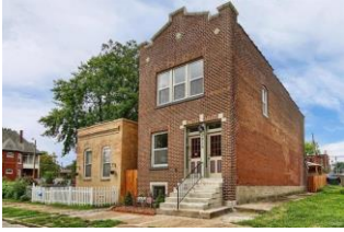
2829 Iowa Ave, 63118 3 beds, 2.5 baths, 1,996 sq. ft. - $229,000 (Pending)