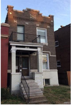
2832 Texas Ave, 63118 2-family, 1,938 sq. ft. - $79,900