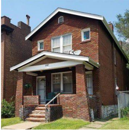
3107 Wyoming St, St. Louis, MO 63118 2-family, 2,090 sq. ft. - $70,000

SEVERAL CDA AND LRA PROPERTIES LISTED HERE ARE NOW OPTIONED. WE'RE TRYING TO GET A LIST FROM THE CITY. THANK YOU FOR YOUR PATIENCE AND UNDERSTANDING.