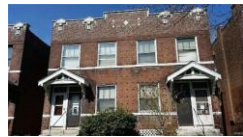
2857 Texas Ave, St. Louis, MO 63118 4-family, N/A sq. ft. - $89,900