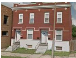
2806-2808 Iowa Ave, St. Louis, MO 63118 4-family, 3,600 sq. ft. - $132,500