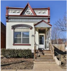
3149 Ohio Ave, 63118 2 beds, 1 bath, 907 sq. ft. - $100,000