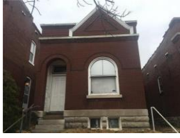
2909 Wyoming St, 63118 1 bed, 1 bath, 813 sq. ft. - $34,000