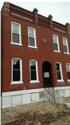
2639 Wyoming St, 63118 2-family, 1,899 sq. ft. - $74,900 NEW