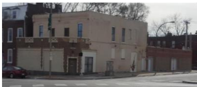
3424-3426 Cherokee St, 63118 Mixed Use, 10,040 sq. ft. - $90,000