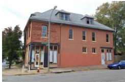
3133 Cherokee St, St. Louis, MO 63118 Mixed Use, 3,790 sq. ft. - $115,000