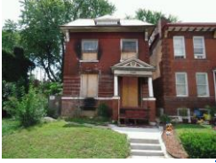
2746 Utah Street 2-family, 1472 sq. ft. - $1,500