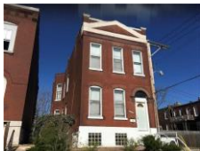
3215 Texas Ave, St. Louis, MO 63118 2 beds, 2 baths, 1,994 sq. ft. - $50,500