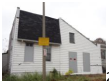
2716 Utah Street 2 Beds, 1 bath, 1,020 sq. ft. - $1,500