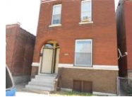
2824 Iowa Ave, St. Louis, MO 63118 2-family 2,066 sq. ft. - $79,900