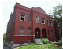
3214 Pennsylvania Ave 4-family, 4,640 sq. ft. - $6,000