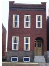
3104 Wyoming Street 2- family, 1,710 sq. ft. - $3,000

On most Fridays, we'll post properties for-sale in our neighborhood. If you have a property you'd like featured, let us know.