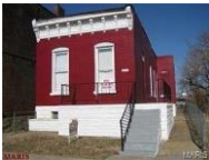
2713 Utah St, St. Louis, MO 63118 1 bed, 1 bath, 920 sq. ft. - $24,900