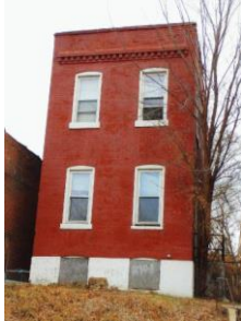
2908 Texas Ave Single family, 1,356 sq. ft. - $6,000