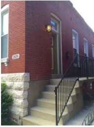
2839 Wyoming St, St. Louis, MO 63118 2 beds, 1.5 baths, 1,152 sq. ft. - $119,000