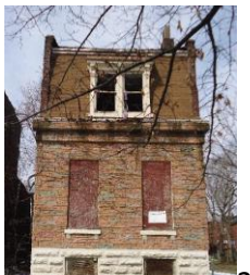
2831 S. Jefferson Ave Bed, bath, sq. ft. - $1,500