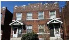
2857 Texas Ave, St. Louis, MO 63118 4-family, N/A sq. ft. - $92,500