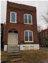
3001 California Ave, St. Louis, MO 63118 2-family, 2,100 sq. ft. - $39,900