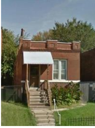
3340 Michigan Ave, St. Louis, MO 63118 2 beds, 1 bath, 835 sq. ft. - $20,000