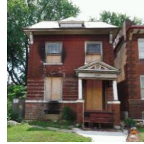
2746 Utah Street 2-family, 1472 sq. ft. - $1,500