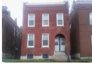
3437 Virginia Ave, St. Louis, MO 63118 2-family, 2727 sq. ft. - $90,000