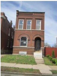
3329 Texas Ave, St. Louis, MO 63118 4 beds, 2 baths, 2,098 sq. ft. - $63,000