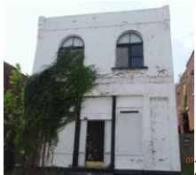
2704 Utah Street Mixed use, 3,500 sq. ft. – Appraisal Only