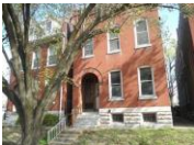
2917 Cherokee St, St. Louis, MO 63118 2-family, N/A sq. ft. - $53,000