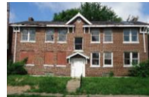
3209 Nebraska Ave 4-family, 2,970 sq. ft. - $6,000