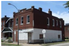
3147 Pennsylvania Ave Mixed use, 1 st floor 1,326 sq. ft. (NSP)