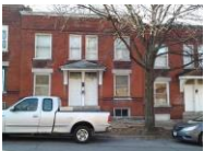
3118 Utah St, St. Louis, MO 63118 2-family, 1,980 sq. ft. - $58,000