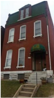
3108 Wyoming St, St. Louis, MO 63118 4 beds, 3.5 baths, 2,728 sq. ft. - $49,000 NEW