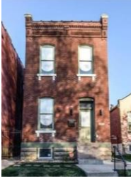
2922 Texas Ave, St. Louis, MO 63118 2 beds, 2.5 baths, 2,570 sq. ft. - $189,900