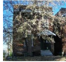
3181 Minnesota Ave 2-family, 1824 sq. ft. - $2,500