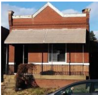
3011 Utah St, St. Louis, MO 63118 2 beds, 1 bath, 1,100 sq. ft. - $20,000