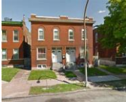
3306 Louisianan Ave, St. Louis, MO 63118 4-family, 3,196 sq. ft. - $99,500