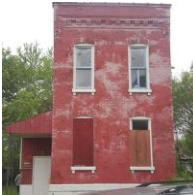
3333 Minnesota Ave, St. Louis, MO 63118 4 beds, 2 baths, 1,700 sq. ft. - $55,000