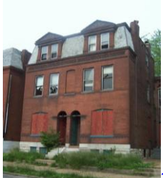
3135 California Ave 4-family, 5370 sq. ft. - $6,000