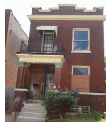
3324 Louisiana Ave Single family, 2,028 sq. ft. - $3,000