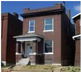
3109 Wyoming St, St. Louis, MO 63118 3 beds, 2 baths, 1,824 sq. ft. - $74,900