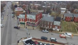
2800 Ohio Ave, St. Louis, MO 63118 Seven Properties Package - $949,000