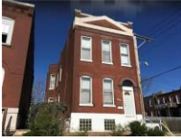
3215 Texas Ave, St. Louis, MO 63118 2 beds, 2 baths, 1,994 sq. ft. - $79,500