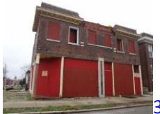
3302 California Ave Mixed Use, 3354 sq. ft. - Appraisal Only