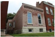
3173 Nebraska Ave, St. Louis, MO 63118 1 bed, 1 bath, 1,044 sq. ft. - $90,000