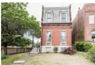
3133 Oregon Ave, St. Louis, MO 63118 3 beds, 1.5 baths, 1,800 sq. ft. - $145,000

Open House: Sun, July 2 from 1:00-3:00 pm