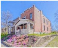
3162 Nebraska Ave, St. Louis, MO 63118 3 beds, 2 baths, 2,650 sq. ft. - $173,900