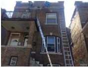
3230 Michigan Ave, St. Louis, MO 63118 2-family, 2,310 sq. ft. - $69,000