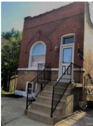
3243 Texas Ave, St. Louis, MO 63118 2 beds, 2 baths, 731 sq. ft. - $89,000