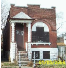
3417 Louisiana Ave Single family, 816 sq. ft.

Visit the CDA site for information on purchasing. Those with (NSP) by the listing are a part of the Neighborhood Stabilization Program fund. Vacant lots not listed below.