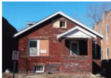
3021 Texas Ave Single family, 1,400 sq. ft. (NSP)