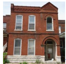
3229 Pennsylvania Ave 2-family, 1320 sq. ft. - $3,000