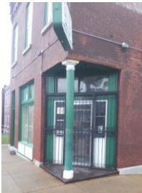
3301 Minnesota Ave, St. Louis, MO 63118 Mixed Use, N/A sq. ft. - $65,000