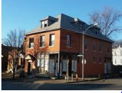
3133 Cherokee St, St. Louis, MO 63118 Mixed Use, 3,790 sq. ft. - $120,000