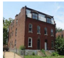
2839 Ohio Ave 2-family, 4,614 sq. ft. - $6,000