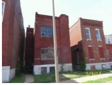
2929 California Ave Bed, bath, sq. ft. - $1,500