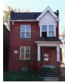
2750 Utah Street Bed, bath, sq. ft. - $3K