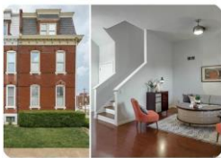
3129 Ohio Ave, St. Louis, MO 63118 3 beds, 2.5 baths, 2,358 sq. ft. - $189,000

Open House: Sun, July 2 from 1:00-3:00 pm