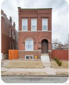
3329 Texas Ave, 63118 3 beds, 2 baths, 2,098 sq. ft. - $185,000 (Contingent)