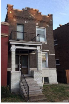
2832 Texas Ave, 63118 2-family, 1,938 sq. ft. - $79,900