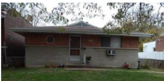
3172 Pennsylvania Ave, 63118 3-family, 1,800 sq. ft. - $115,000