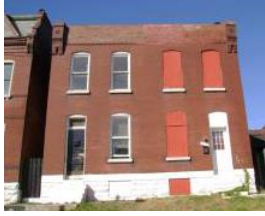
3175 Oregon Ave Half of 4-family conversion, 1,350 sq. ft. (OPTIONED)