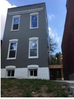
2909 Texas Ave, 63118 3 beds, 3 baths, 1,828 sq. ft. - $169,000