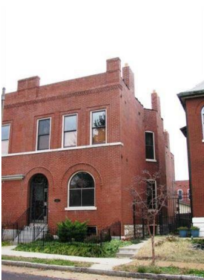
2647 Wyoming St, 63118 3 beds, 2.5 baths, 2,432 sq. ft. - $249,900 (Contingent)