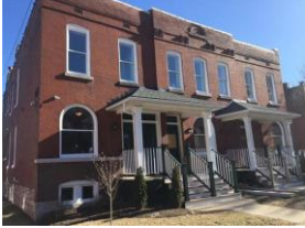
3000 Texas Ave, 63118 3 beds, 2 baths, 1,652 sq. ft. - $117,000 (Contingent)