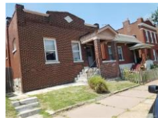
3315 Texas Ave, St. Louis, MO 63118 2 beds, ` bath, 950 sq. ft. - $50,000 (Pending)