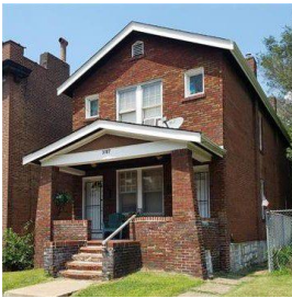
3107 Wyoming St, St. Louis, MO 63118 2-family, 2,090 sq. ft. - $70,000

SEVERAL CDA AND LRA PROPERTIES LISTED HERE ARE NOW OPTIONED. WE'RE TRYING TO GET A LIST FROM THE CITY. THANK YOU FOR YOUR PATIENCE AND UNDERSTANDING.