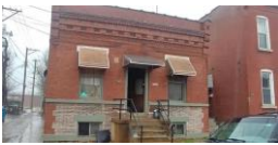
3343 Louisiana Ave, 63118 2-family, 1,500 sq. ft. - $29,900 (Pending)