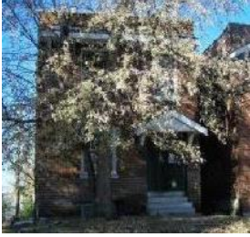
3181 Minnesota Ave 2-family, 1824 sq. ft. - $2,500