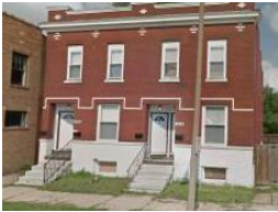
2806-2808 Iowa Ave, St. Louis, MO 63118 4-family, 3,600 sq. ft. - $132,500