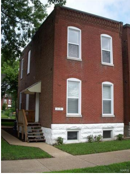
3119 Iowa Ave, 63118 3 beds, 1.5 baths, 1,636 sq. ft. - $155,000 (Contingent)