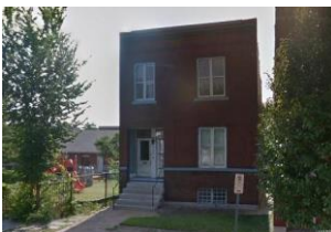
3122 California Ave, 63118 2-family, 1,620 sq. ft. - $29,888 (Contingent)