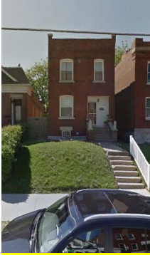
3443 Louisiana Ave, 63118 3 beds, 3 baths, 1,776 sq. ft. - $87,500 NEW