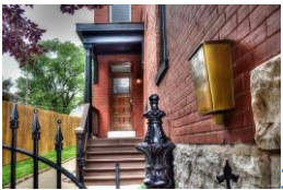
3239 Ohio Ave, 63118 2 beds, 1.5 baths, 1,842 sq. ft. - $249,000