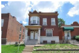
3450 Tennessee Ave, 63118 2-family, 2,162 sq. ft. - $128,900