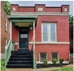
3340 Michigan Ave, 63118 2 beds, 1.5 baths, 835 sq. ft. - $125,000 (Pending)