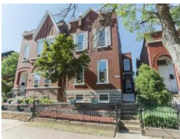
2911 Wyoming St, 63118 3 beds, 2.5 baths, 1,958 sq. ft. - $220,000 (Contingent)