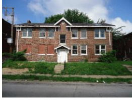
3209 Nebraska Ave 4-family, 2,970 sq. ft. - $6,000