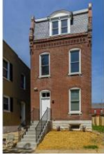
2821 Texas Ave, 63118 3 beds, 2.5 baths, 2,000 sq. ft. - $190,000 (Contingent)