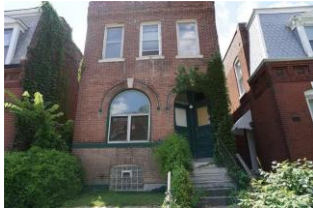
3131 Oregon Ave, 63118 2-family, 2,286 sq. ft. - $18,000 NEW