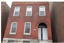
2752 Wyoming St, 63118 2-family, N/A sq. ft. - $159,900

SEVERAL CDA AND LRA PROPERTIES LISTED HERE ARE NOW OPTIONED. WE'RE TRYING TO GET A LIST FROM THE CITY. THANK YOU FOR YOUR PATIENCE AND UNDERSTANDING.