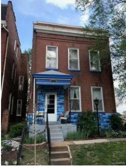
3339 Oregon Ave, 63118 3 beds, 2 baths, 2,088 sq. ft. - $100,000 (Pending)