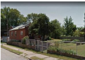
3144 Oregon Ave, 63118 1 bed, 1 bath, 999 sq. ft. - $34,888 (Contingent)