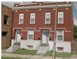
2806-2808 Iowa Ave, St. Louis, MO 63118 4-family, 3,600 sq. ft. - $132,500