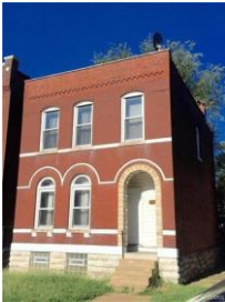
3251 Michigan Ave, St. Louis, MO 63118 4 beds, 2 baths, 1,408 sq. ft. 0 $36,000