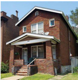
3107 Wyoming St, St. Louis, MO 63118 2-family, 2,090 sq. ft. - $70,000

SEVERAL CDA AND LRA PROPERTIES LISTED HERE ARE NOW OPTIONED. WE'RE TRYING TO GET A LIST FROM THE CITY. THANK YOU FOR YOUR PATIENCE AND UNDERSTANDING.