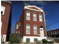
3215 Texas Ave, St. Louis, MO 63118 2 beds, 2 baths, 1,994 sq. ft. - $50,500 (Pending)