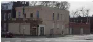
3424-3426 Cherokee St, 63118 Mixed Use, 10,040 sq. ft. - $90,000 (Pending)