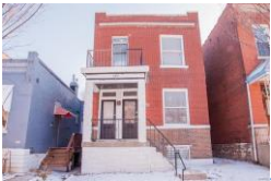
3334 Michigan Ave, 63118 3 beds, 2.5 baths, 1,784 sq. ft. - $194,900