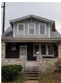
3416 Virginia Ave, 63118 2 beds, 1 bath, 816 sq. ft. - $29,900 (Pending)