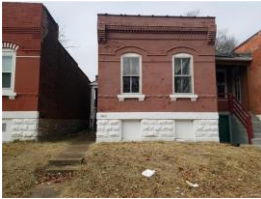
3433 Louisiana Ave, 63118 1 bed, 1 bath, 796 sq. ft. - $10,000 (Pending)