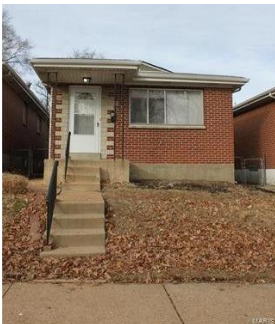
3217 Potomac St, 63118 2 beds, 1 bath, 874 sq. ft. - $47,900 (Pending)