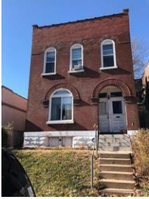
3331 Iowa Ave, 63118 2 beds, 1 bath, 1,420 sq. ft. - $69,900 (Pending)