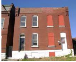
3175 Oregon Ave Half of 4-family conversion, 1,350 sq. ft. (OPTIONED)