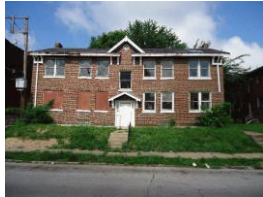
3209 Nebraska Ave 4-family, 2,970 sq. ft. - $6,000