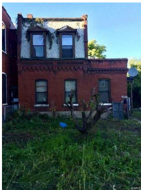
2801 Arsenal St, 63118 4 beds, 2 baths, 2,156 sq. ft. - $100,000 (Pending)