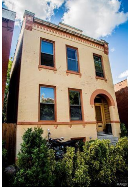
3329 Michigan Ave, 63118 3 beds, 2 baths, 2,408 sq. ft. - $152,000