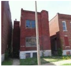
2929 California Ave Bed, bath, sq. ft. - $1,500

*Most will be total gut rehabs; vacant lots not listed.