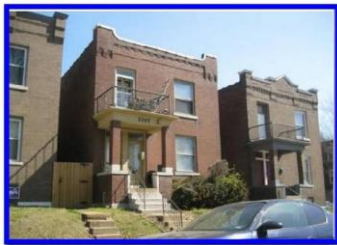
3205 Potomac St, 63118 2-family, 2,298 sq. ft. - $60,060