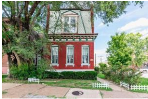
2617 Arsenal St, 63118 3 beds, 1.5 baths, 1,769 sq. ft. - $244,900