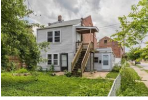
3129 California Ave, 63118 4 beds, 2 baths, 1,560 sq. ft. - $44,888 (Pending)