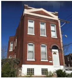
3215 Texas Ave, 63118 2 beds, 2 bath, 1,994 sq. ft. - $96,500