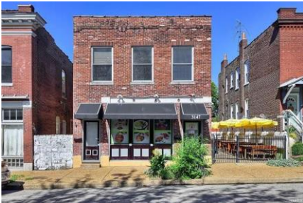
3147 Cherokee St, 63118 Mixed Use, 2,750 sq. ft. - $299,000 NEW