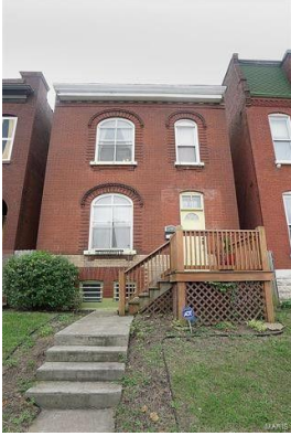
3106 Wyoming St, 63118 2 beds, 1 bath, 1,518 sq. ft. - $125,000