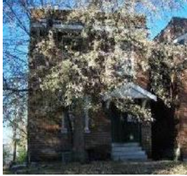
3181 Minnesota Ave 2-family, 1824 sq. ft. - $2,500