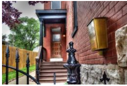
3239 Ohio Ave, 63118 2 beds, 1.5 baths, 1,842 sq. ft. - $218,500