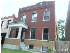
3304 Texas Ave, 63118 2-family, 3,134 sq. ft. - $18,700 (Pending)