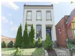
2840 Arsenal St, 63118 4 beds, 3.5 baths, 3,078 sq. ft. - $399,900 (Contingent)