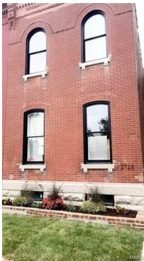
2723 Arsenal St, 63118 3 beds, 2.5 baths, 1,800 sq. ft. - $245,000 NEW