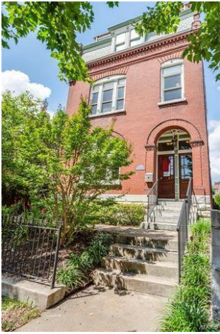
3219 Iowa Ave, 63118 3 beds, 3.5 baths, 2,907 sq. ft. - $295,000 (Contingent)