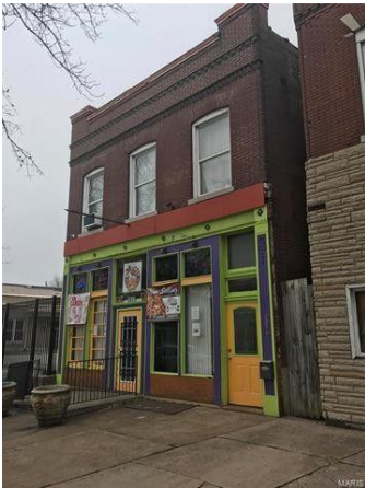
2917 S. Jefferson Ave, 63118 Mixed Use, NA sq. ft. - $199,000