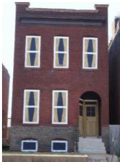
3104 Wyoming Street 2-family, 1,710 sq. ft. - $3,000

On most Fridays, we'll post properties for-sale in our neighborhood. If you have a property you'd like featured, let us know.