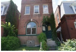
3131 Oregon Ave, 63118 2-family, 2,286 sq. ft. - $14,500 (Pending)