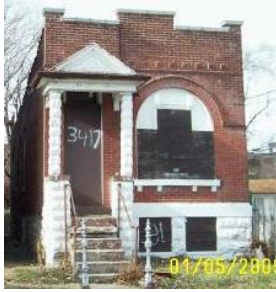
3417 Louisiana Ave Single family, 816 sq. ft.