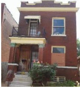
3324 Louisiana Ave Single family, 2,028 sq. ft. - $3,000