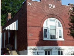
3159 California Ave, 63118 1 bed, 1 bath, 813 sq. ft. - $44,900