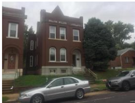
2634 Wyoming St, 63118 3 beds, 2.5 baths, 2,635 sq. ft. - $239,900