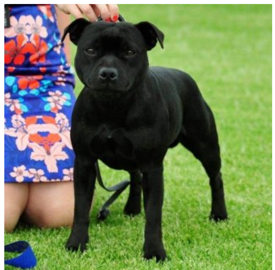
Junior Bitch - 8e/1a