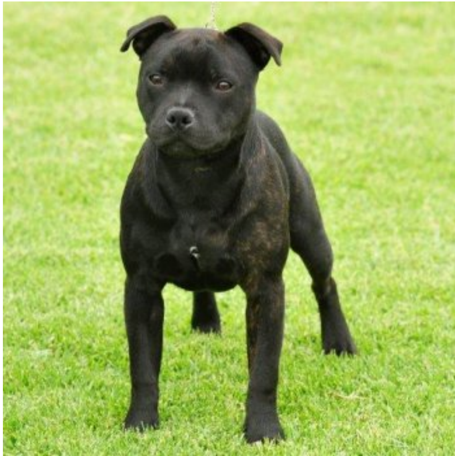
Minor Puppy Dog - 4e/1a