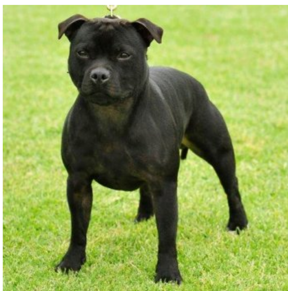
Intermediate Dog - 6e/1a