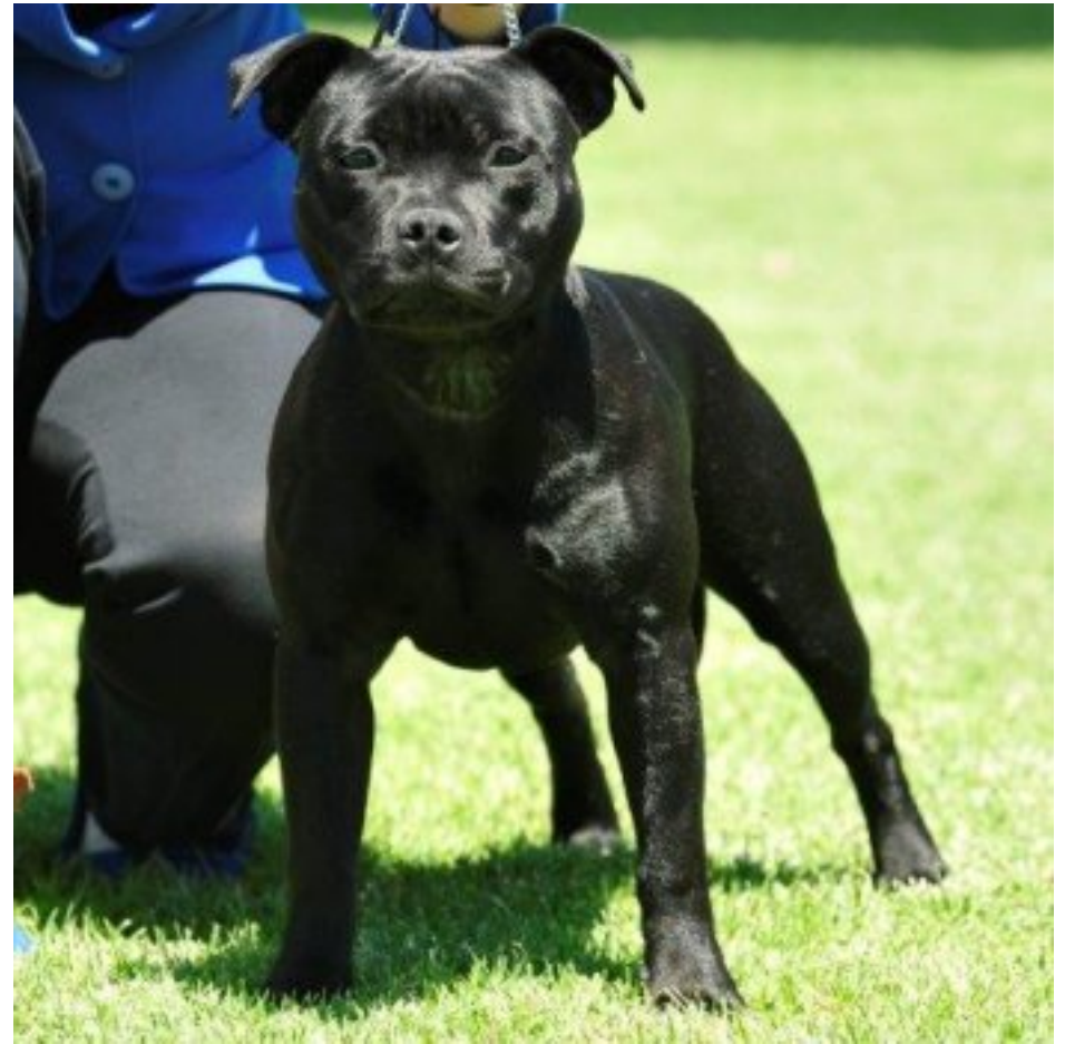
Minor Puppy Bitch - 1e

Red dog good pigment not same quality as the first two