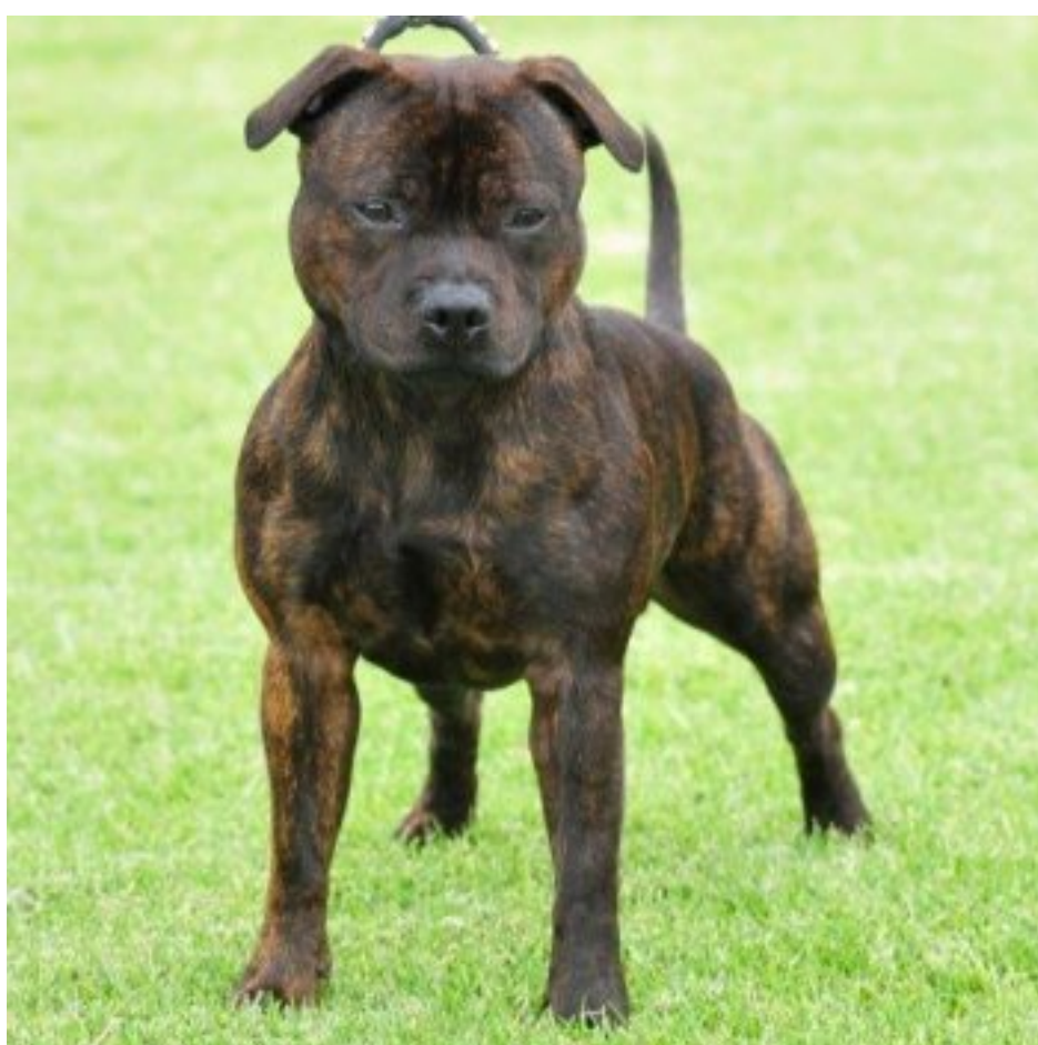
Junior Dog - 6e/a