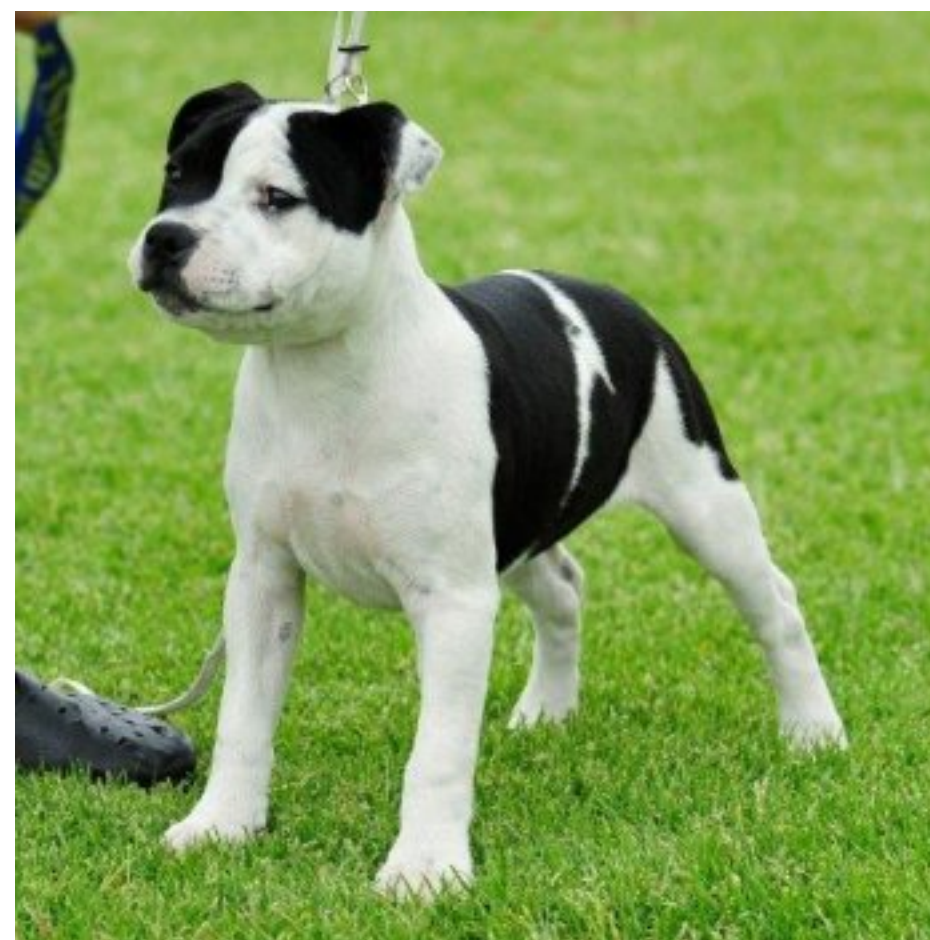
Baby Puppy Bitch - 6e/a