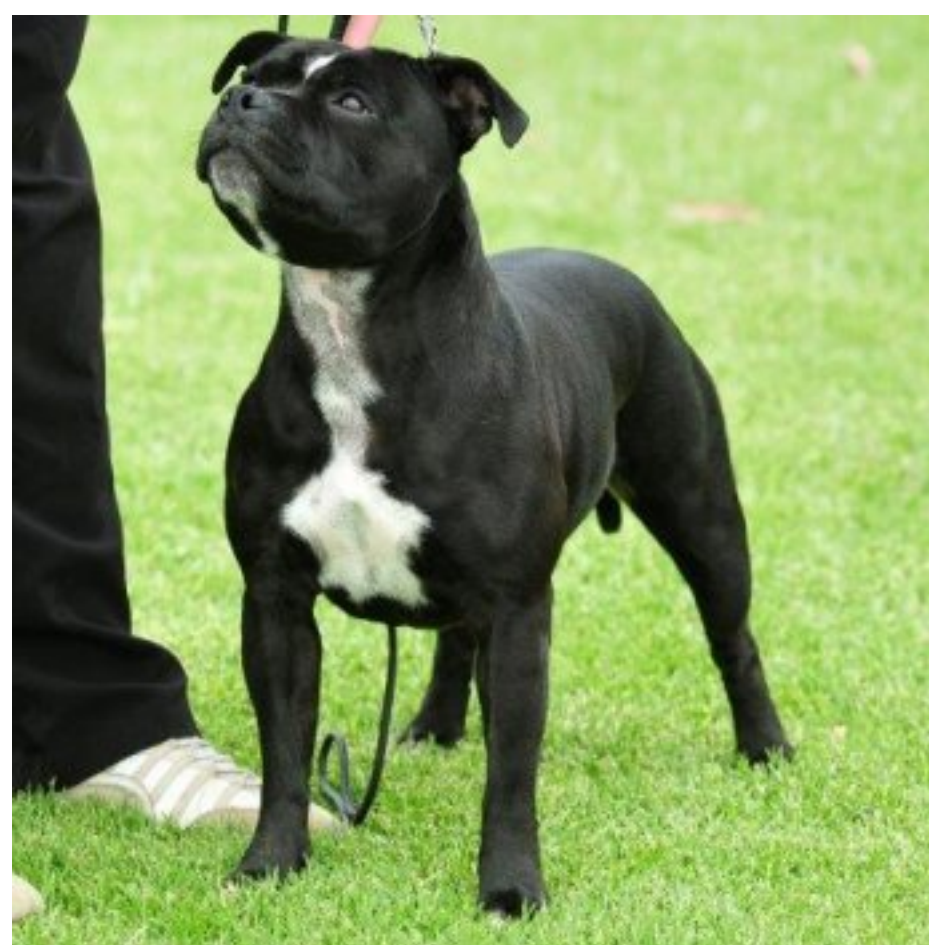
Intermediate Bitch - 12e/1a

Pied dog lost out on head to first and second