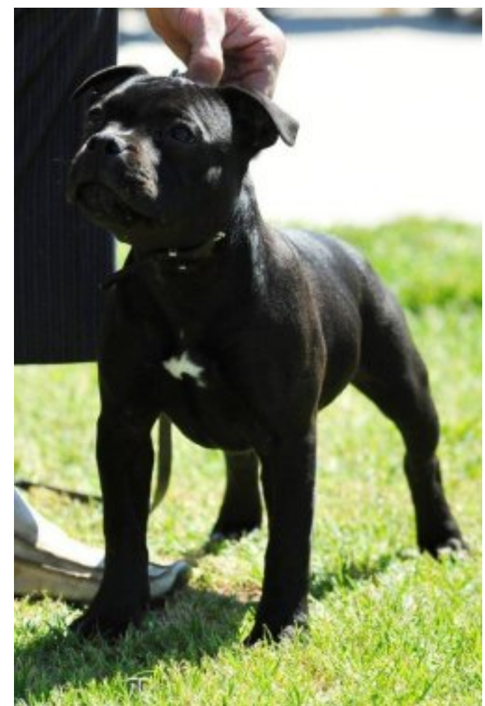
Baby Puppy Bitch - 8e/1a