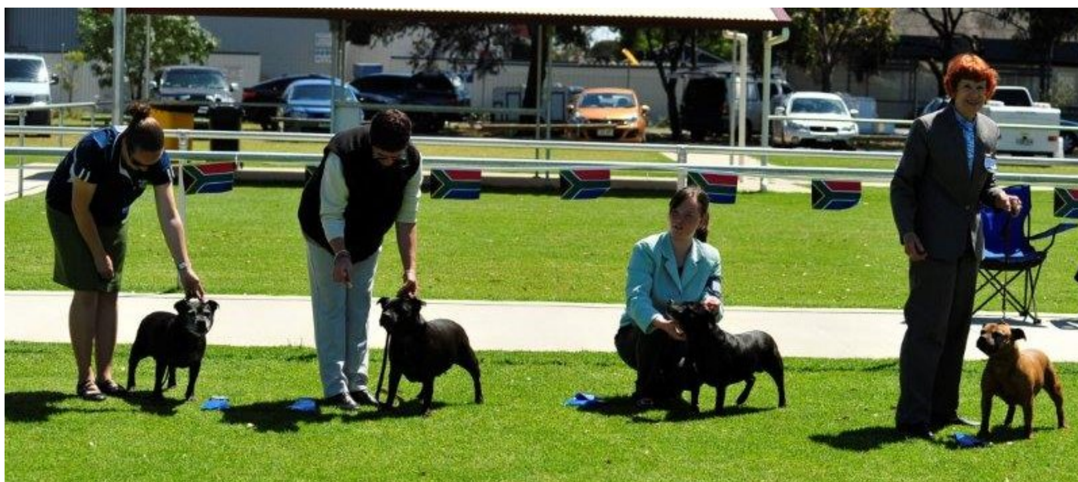
PARADE OF VETERANS