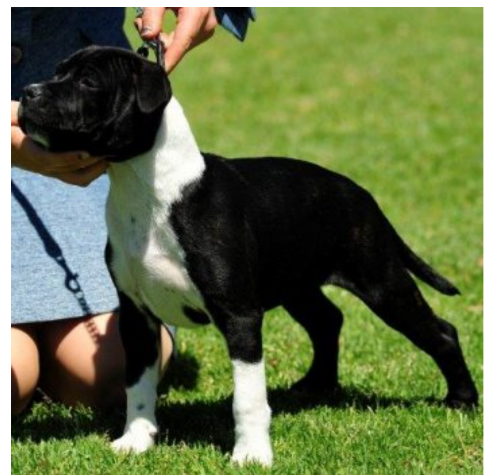
Baby Puppy Bitch - 7e/a

Black brindle.Has everything required at this moment in time,