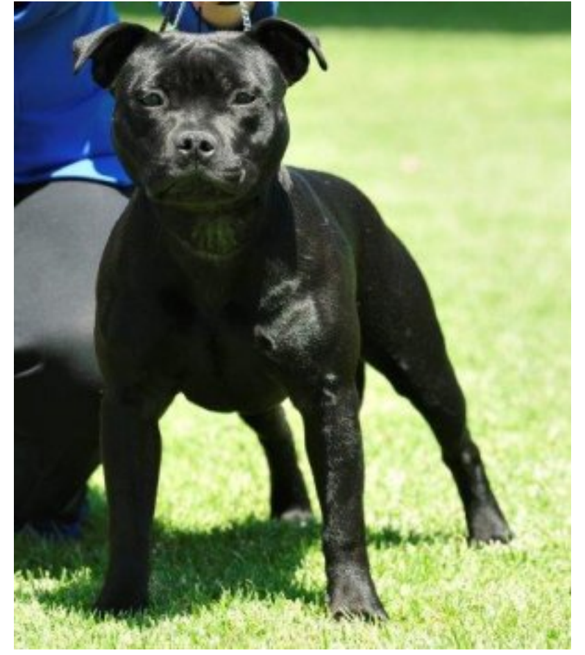
Minor Puppy Bitch - 3e