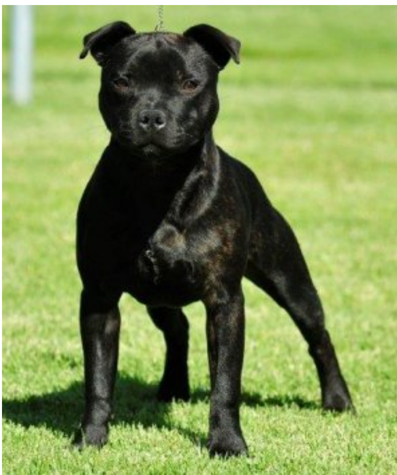
Minor Puppy Dog - 6e/1a