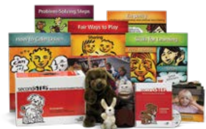
Kindergarten–Grade 5 Second Step program

The evidence-based program helps make it easy for teachers to integrate social-emotional learning into their classrooms, which decreases problem behaviors and increases whole-school success by promoting self-regulation, safety, and support. The program aligns with many other school initiatives and standards, including Positive Behavior For Learning (PBL), Response to Intervention (RTI), Restorative Practices, and trauma-informed practices.