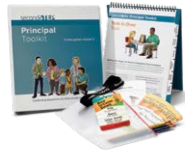
Second Step Principal Toolkit

Tools include scripted meeting agendas to introduce all staff to the program; ready-to-use morning announcements, school assembly scripts, and communications to staff and families; and an office referral conversation guide to engage students in planning how to use Second Step skills to change behavior. The toolkit supports skill reinforcement in and out of the classroom, encourages positive behavior with a common schoolwide language, and strengthens efforts to create a safe, supportive environment for learning.