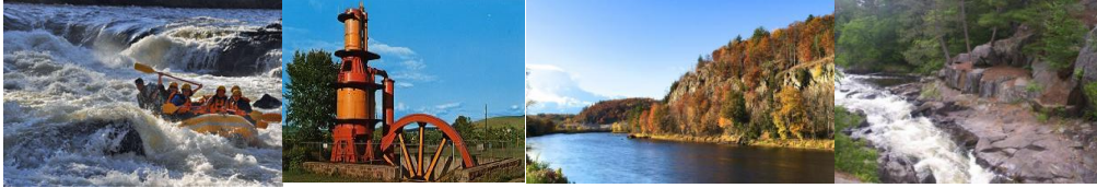
Michigan Earth Science Teachers Association in cooperation with Wisconsin Society of Science Teachers

Integrated science with real world connections, plus a lot of fun !!