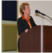
CLE Programs: Live