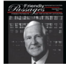
Please look forward to the newest issue of FRIENDLY PASSAGES