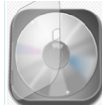
CLE Programs: Florida Bar audio programs