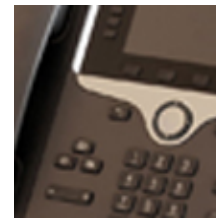
Reference Service by Telephone