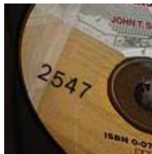
CLE: Borrow Florida Bar Audio Recordings