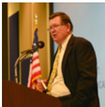
CLE: Live on June 29 and July 27

A monthly newsletter brought to you by the Rupert J. Smith Law Library of St. Lucie County Volume 1, Issue 3 Click here to read the Law Library News on our website. June 2018