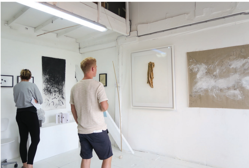
Left: Visitors explore contemporary art on display