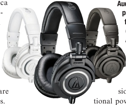
Audio-Technica's ATH-M50xMG professional monitor headphones family: (from left) ATH-M50xWH (white), ATH-M50x (black) and ATH-M50xMG (matte gray).

BOOTH 503 Audio-Technica is displaying the ATH-M50xMG Professional Monitor Headphones, a limited-edition matte gray version of A-T's popular ATH-M50x and part of A-T's M-Series line of headphones. The included cables and storage pouch are gray to match the headphones.