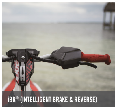
iBR® (INTELLIGENT BRAKE & REVERSE)