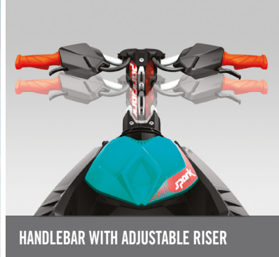
HANDLEBAR WITH ADJUSTABLE RISER