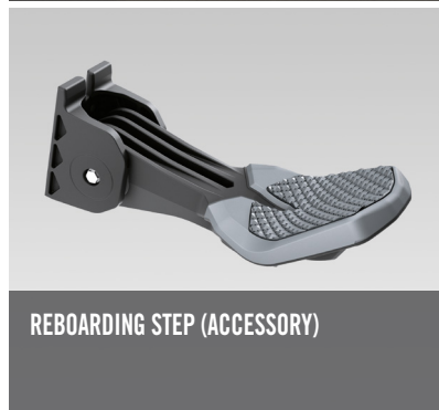
REBOARDING STEP (ACCESSORY)