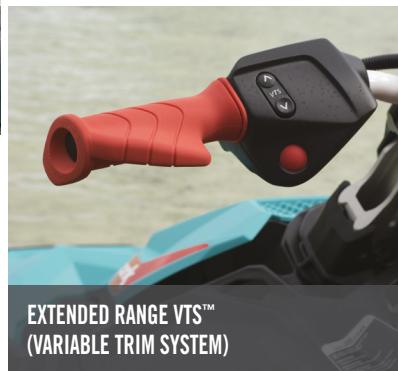
EXTENDED RANGE VTS™ (VARIABLE TRIM SYSTEM)