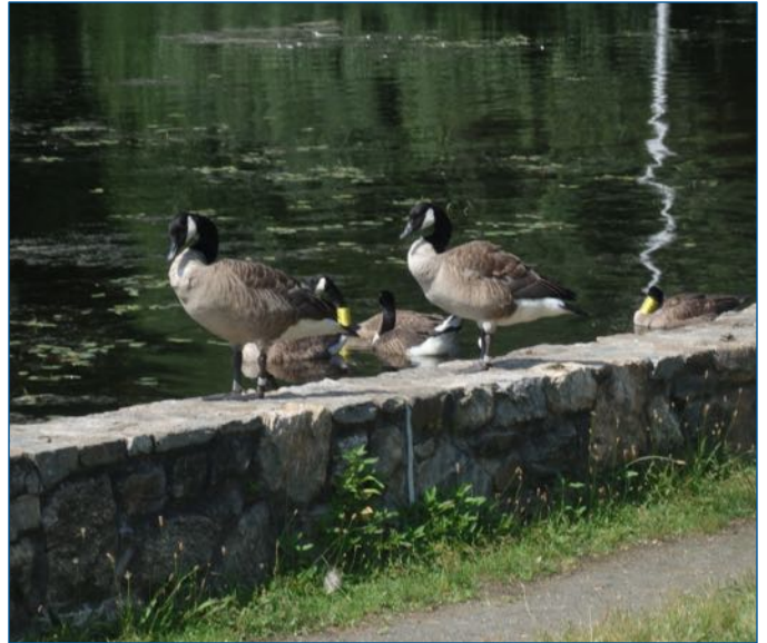
Should we jump in?