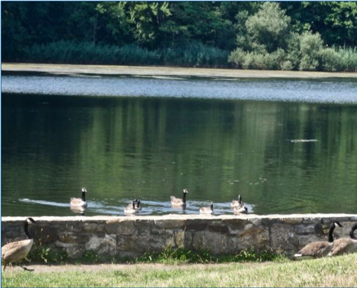
Summer afternoon dilemma: Follow him or take a swim?