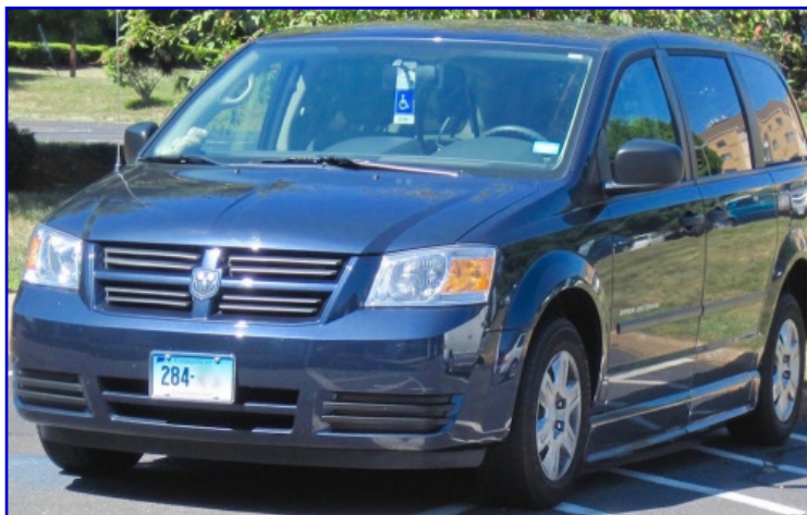
The Grand Caravan now looks as good as it did in 2010

I am not here to complain about Valley Transit District - I like them, and used their service once during the month to attend a business meeting.