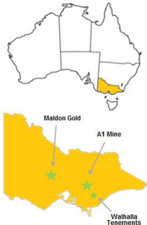
Figure 3: Location of Projects

As announced on 29 December 2014, the Company has executed a Share Sale Agreement with Octagonal Resources Limited (ASX:ORS) to acquire Octagonal's Victorian assets, which includes a fully permitted 150,000 tpa gold processing facility at Maldon.