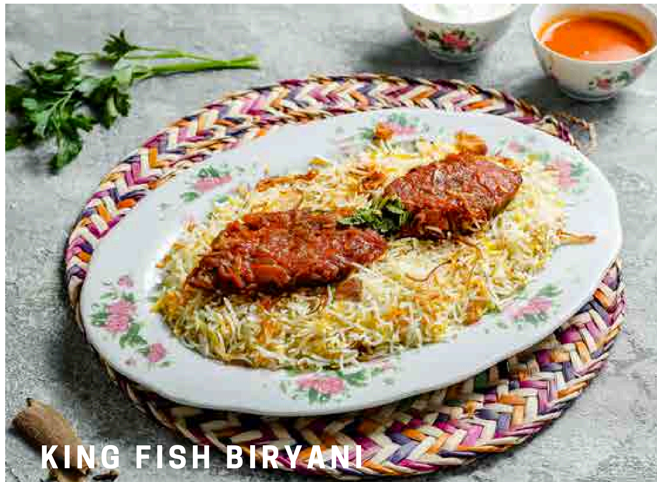
KING FISH BIRYANI