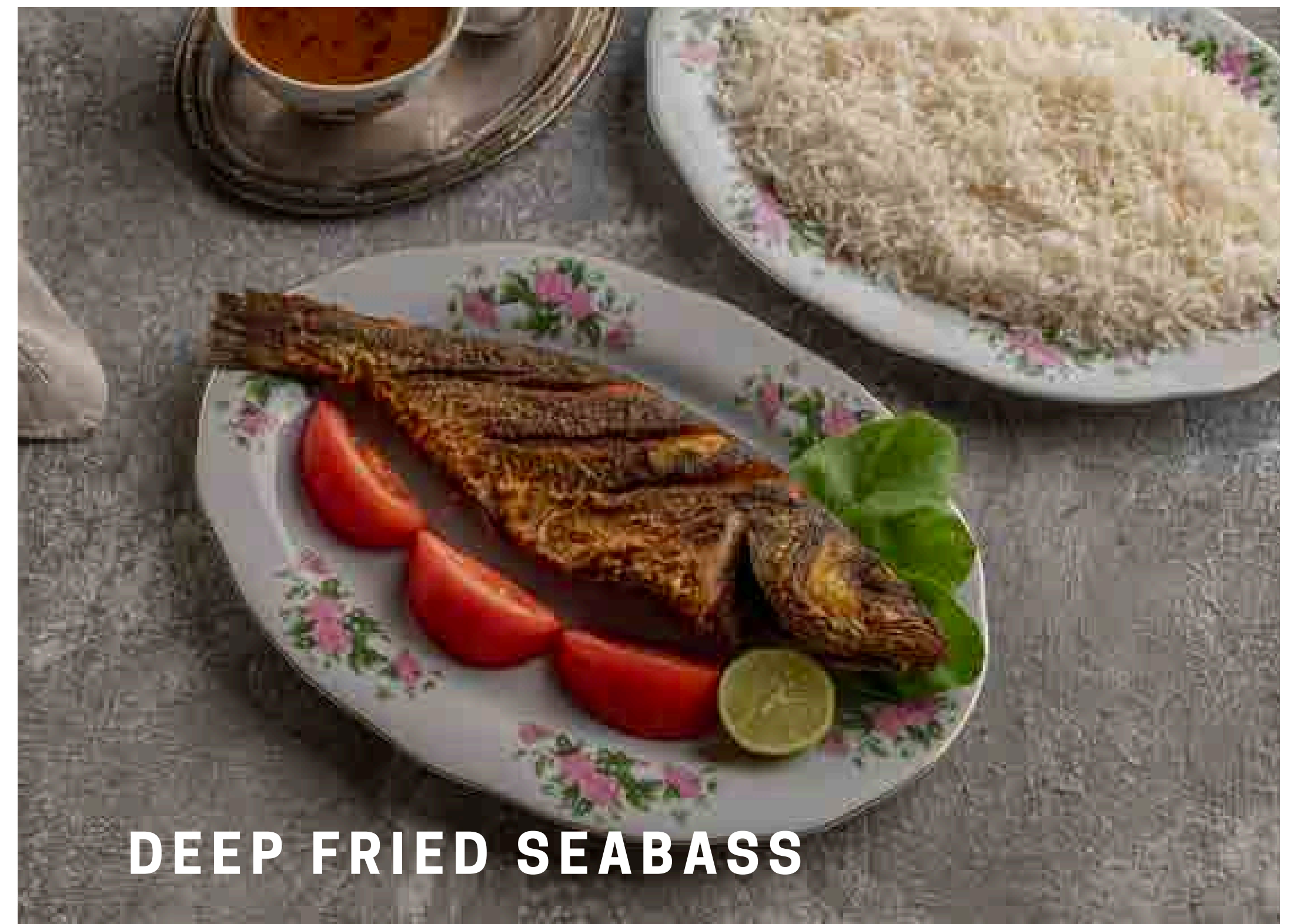
DEEP FRIED SEABASS