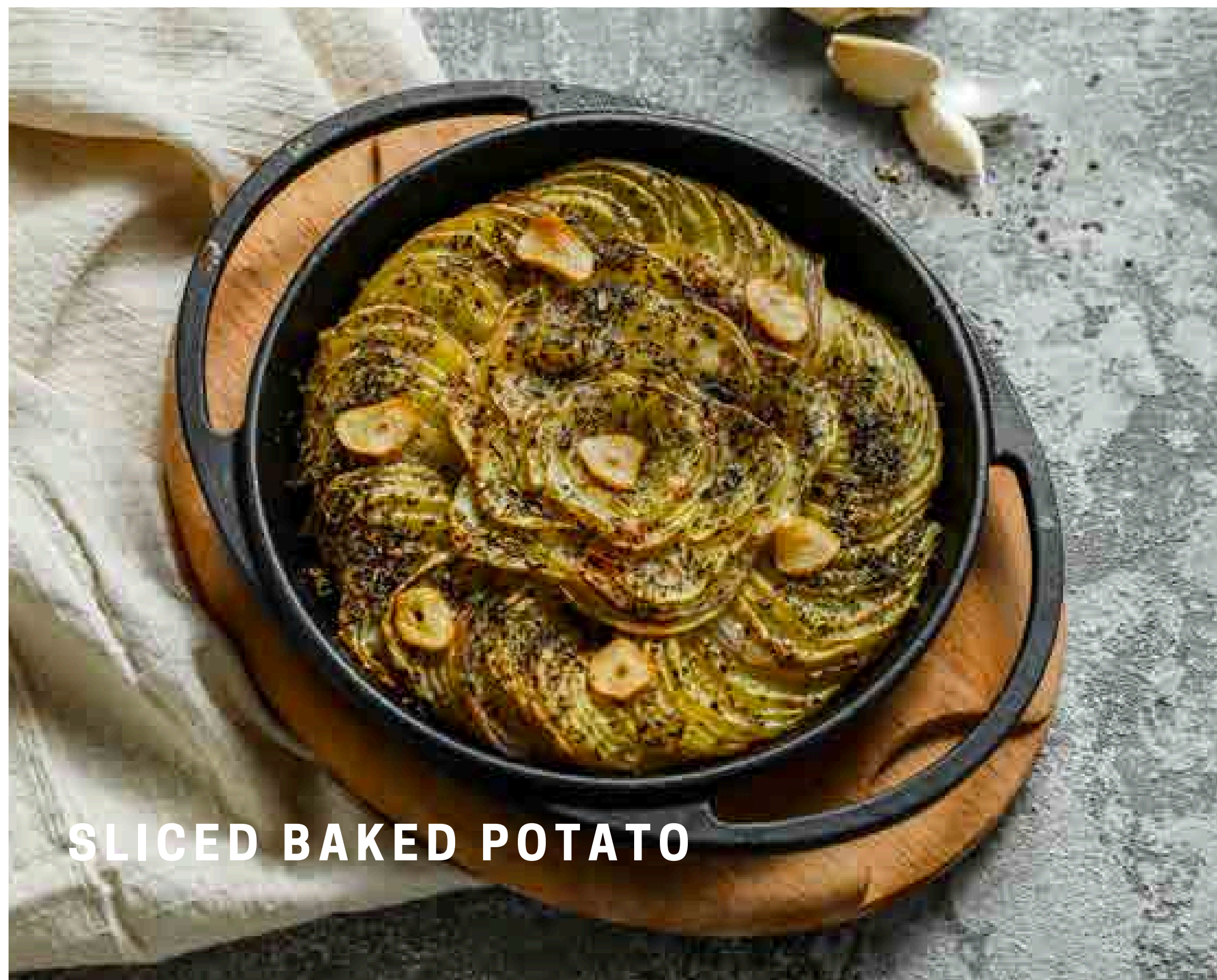
SLICED BAKED POTATO