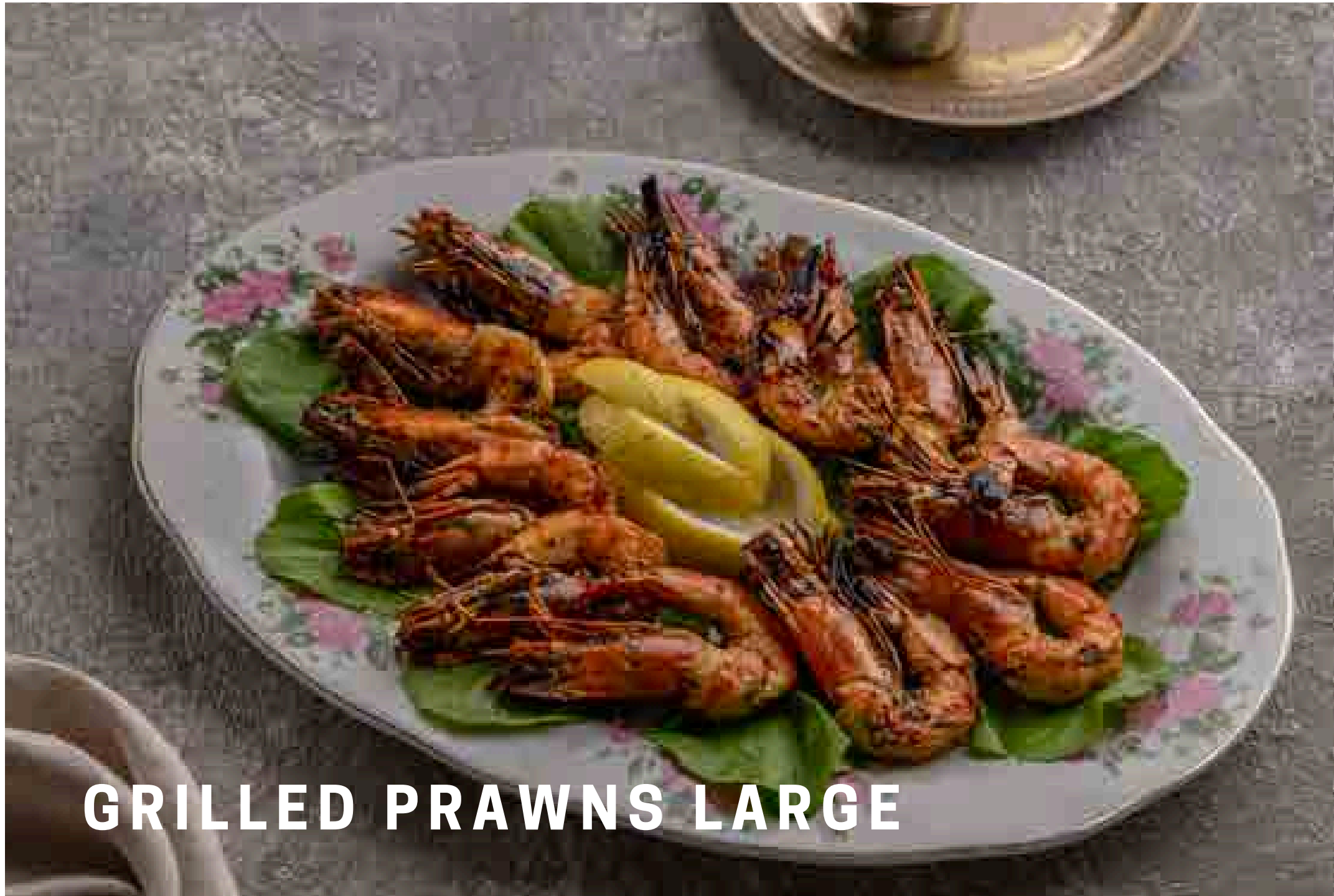
GRILLED PRAWNS LARGE