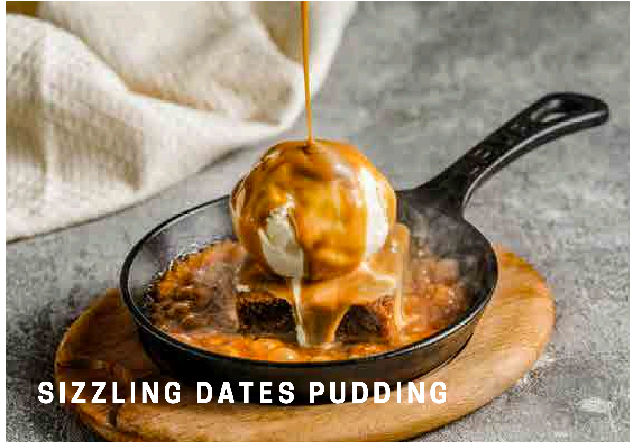
SIZZLING DATES PUDDING

Dates pudding with vanilla ice cream served in sizzling skillet