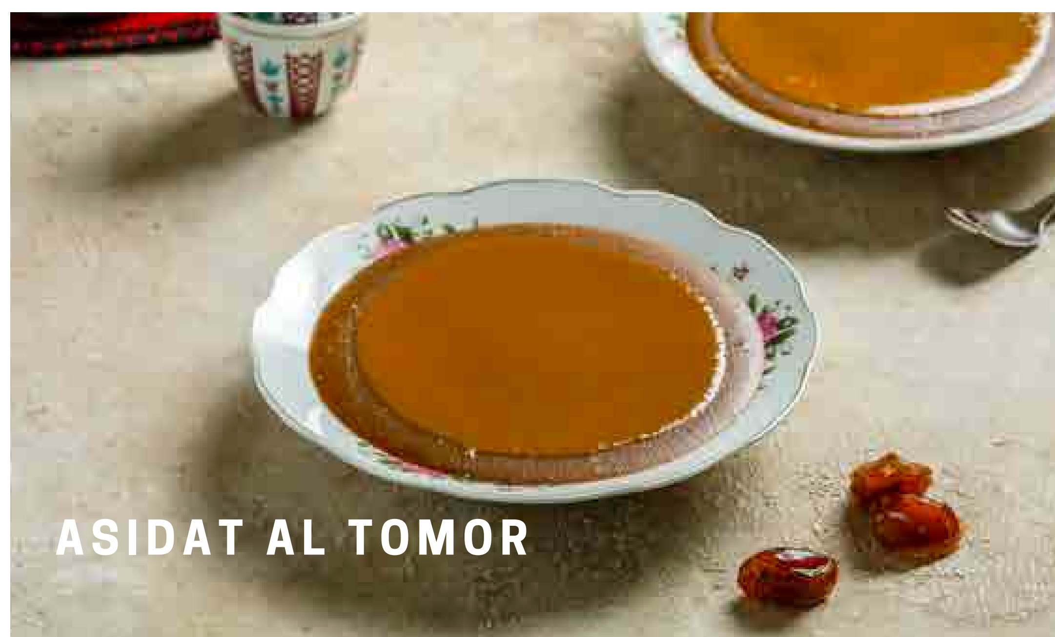
ASIDAT AL TOMOR