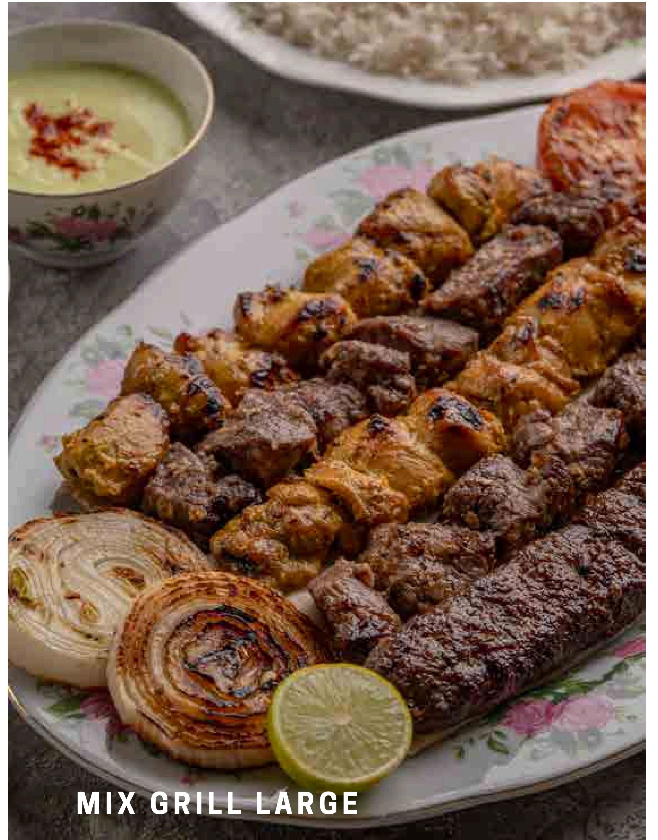
MIX GRILL LARGE