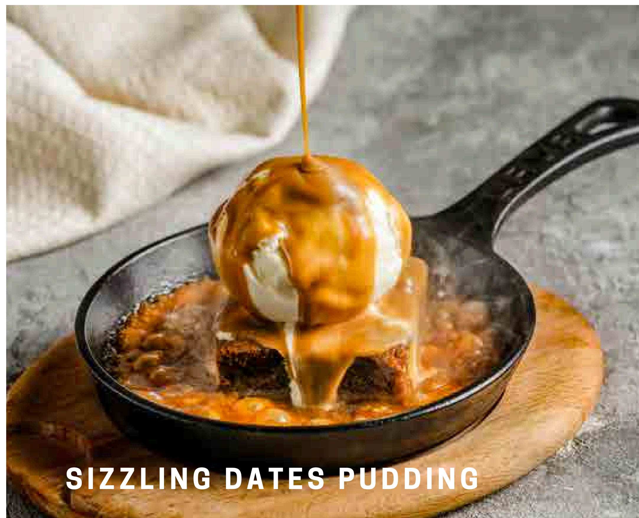
SIZZLING DATES PUDDING

Dates pudding with vanilla ice cream served in sizzling skillet