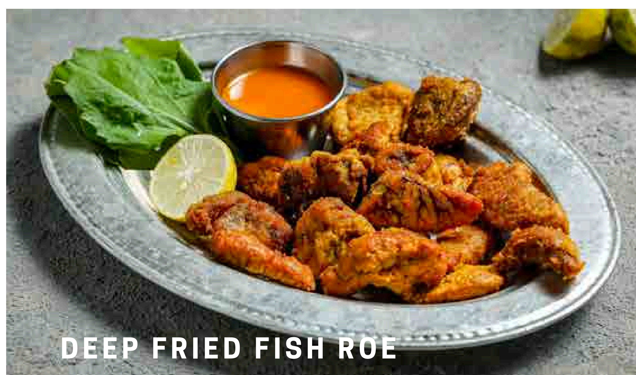
DEEP FRIED FISH ROE