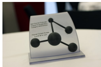
Best Polymer Suppliers Awards