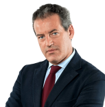
EuPC Annual Meeting 2018