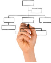
New Structure of Packaging Division and New Division Manager