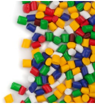
Polymers for Europe Alliance