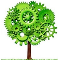
EuPC meets with new Director General of DG GROW