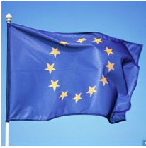
European Commission Publishes Single Market Strategy