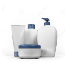
Group on safety evaluation of cosmetics packaging