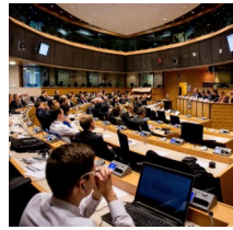
Waste Free Oceans Guardians of the Sea Conference