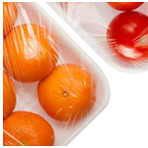
BPA in Food Contact Materials