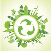
Circular economy package update