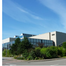
EXCOM meetings in Luxembourg, Ampacet Headquarters