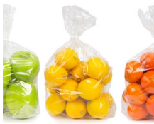
EuPC Food Contact Plastics Seminar 2016: 20 & 21 April