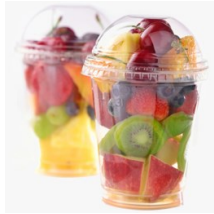
FREP continues to grow