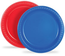
French law on disposables and bags