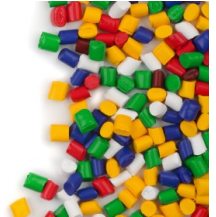
Trade issues / suspension duties