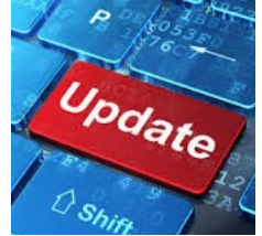
Update on Food Contact Regulations