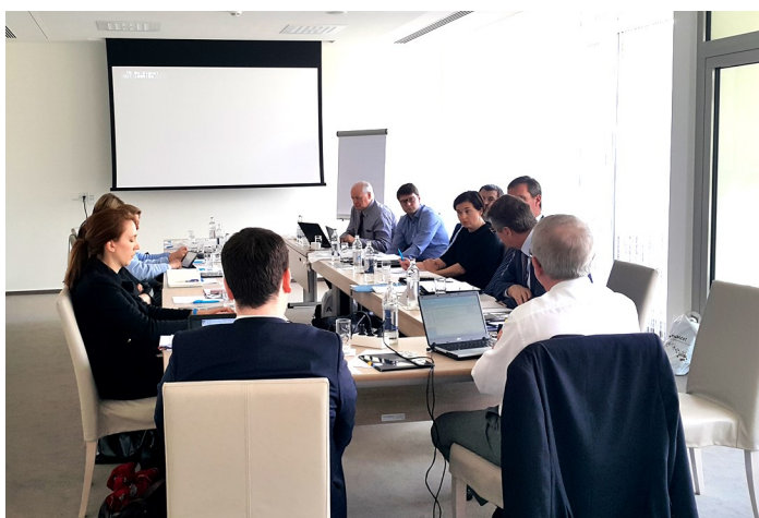
EuPC Packaging Division discussing latest developments in packaging issues during the EXCOM meeting