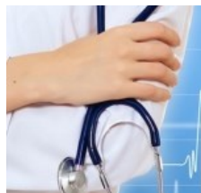
Upcoming MedPharmPlast Europe Conference 2016