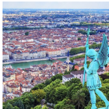
EuPC Study on Competitiveness at the Annual Meeting