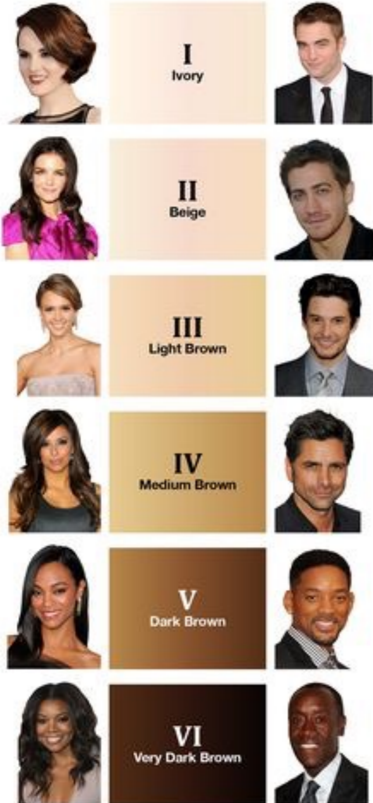
Fitzpatrick Skin type