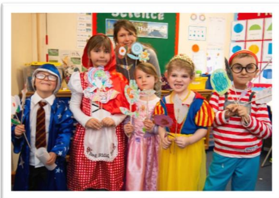
Puppets from Badgemore Primary