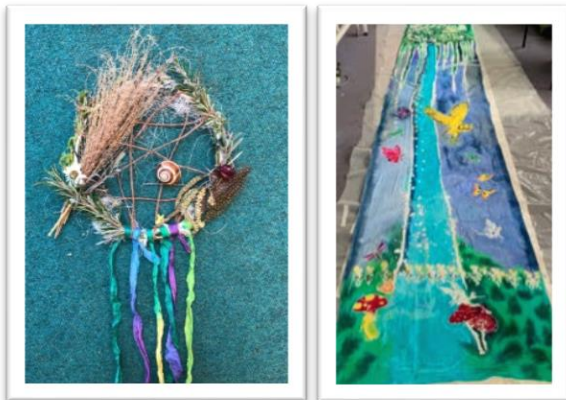
Dream Catchers & Batik Backdrops