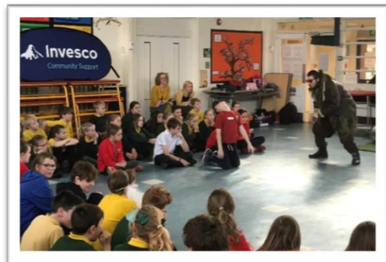
Valley Road & Peppard Primary Young Shakespeare Company Workshop