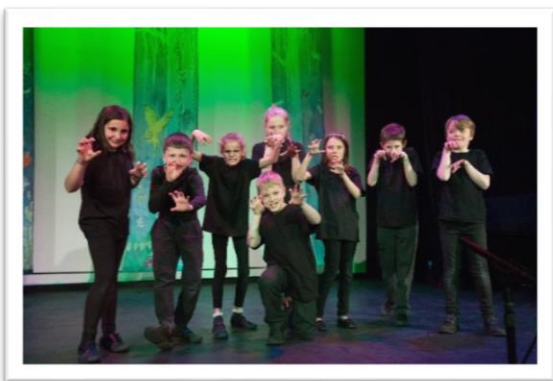
Shiplake Primary - "Now Until the Break of Day"

The initiative brought artwork into the Kenton in the form of scenery and props for a performance by the Young Shakespeare Company (YSC) with Shiplake Primary.