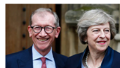
Philip May, husband of the UK prime minister, works for a company that is the largest shareholder in arms manufacturer BAE Systems, whose share price has soared since the recent airstrikes in Syria.

Disgusting Conflict of Interest: Theresa May's Husband's Investment Firm Made a "Financial Killing" from the Bombing of Syria