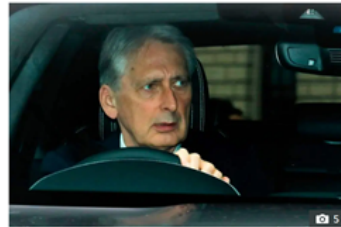
Expedited Conservative Party MP Philip Hammond drives into the Houses of Parliament this week.

Number 10 sparked the investigation after claims officials received intelligence that MP's writing the Benn Act had been helped by foreign powers including France and the European Union.