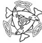
Outer Hebrides Fisheries Trust