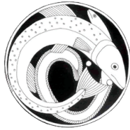
Lochaber Fisheries Trust