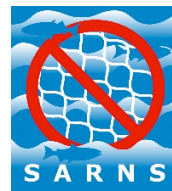
Salmon Aquaculture Reform Network Scotland