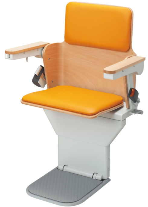
Stair lift for representation purposes only.

In accordance with the D.C. Human Rights Act of 1977, as amended, D.C. Official Code, Section 2-1401.01 et seq., (Act) the District of Columbia does not discriminate based on actual or perceived: race, color, religion, national origin, sex, age, marital status, personal appearance, sexual orientation, familial status, family responsibilities, matriculation, political affiliation, disability, source of income, or place of residence or business.