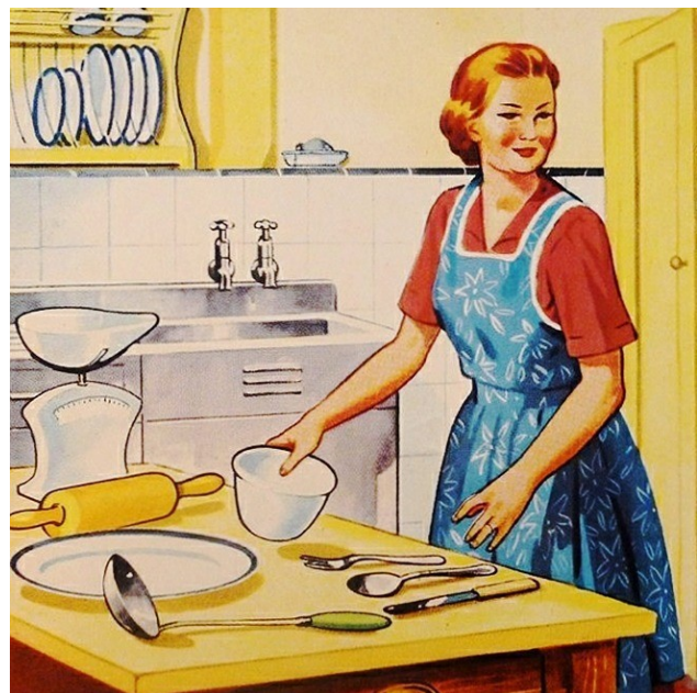
Cartoon depicting a traditional gender role of a woman as a housewife, working in the kitchen.

Applying for a credit card or filling out a job application requires your name, address, and birth-date. Additionally, applications usually ask for your sex or gender. It’s common for us to use the terms “sex” and “gender” interchangeably. However, in modern usage, these terms are distinct from one another.