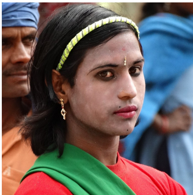
Figure 2: Hijra Dancer in Nepal.

sex was female— and the 18 country TGF to TGM ratio was 3 to 1. TGFs have diverse levels of androgyny —having both feminine and masculine characteristics. For example, five percent of the Samoan population are TGFs referred to as fa'afafine , who range in androgyny from mostly masculine to mostly feminine (Tan, 2016); in Pakistan, India, Nepal, and Bangladesh, TGFs are referred to as hijras , recognized by their governments as a third gender, and range in androgyny from only having a few masculine characteristics to being entirely feminine (Pasquesoone, 2014); and as many as six percent of biological males living in Oaxaca, Mexico are TGFs referred to as muxes , who range in androgyny from mostly masculine to mostly feminine (Stephen, 2002).