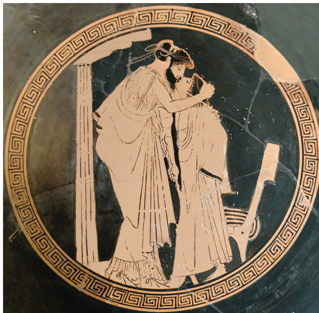
An image on an ancient Greek drinking cup of two lovers kissing. ca. 480 BC

The history of human sexuality is as long as human history itself—200,000+ years and counting (Antón & Swisher, 2004). For almost as long as we have been having sex, we have been creating art, writing, and talking about it. Some of the earliest recovered artifacts from ancient cultures are thought to be fertility totems. The Hindu Kama Sutra (400 BCE to 200 CE)—an ancient text discussing love, desire, and pleasure—includes a how-to manual for having sexual intercourse. Rules, advice, and stories about sex are also contained in the Muslim Qur'an , Jewish Torah , and Christian Bible .