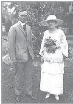
Harry and Bess Truman on their wedding day.