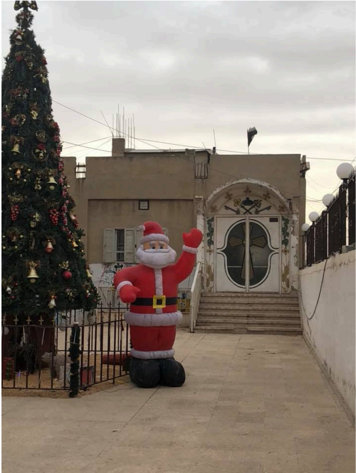
A Christian private school next to a Syriac Orthodox church in Hasakah city. Though the church and school are right next to a Sutoro base, the school flies the Syrian flag (visible in this photo but slightly obscured by the wind) because it teaches the regime's curricula.

In the realm of pre-university education in Jazeera canton, the regime still maintains influence in