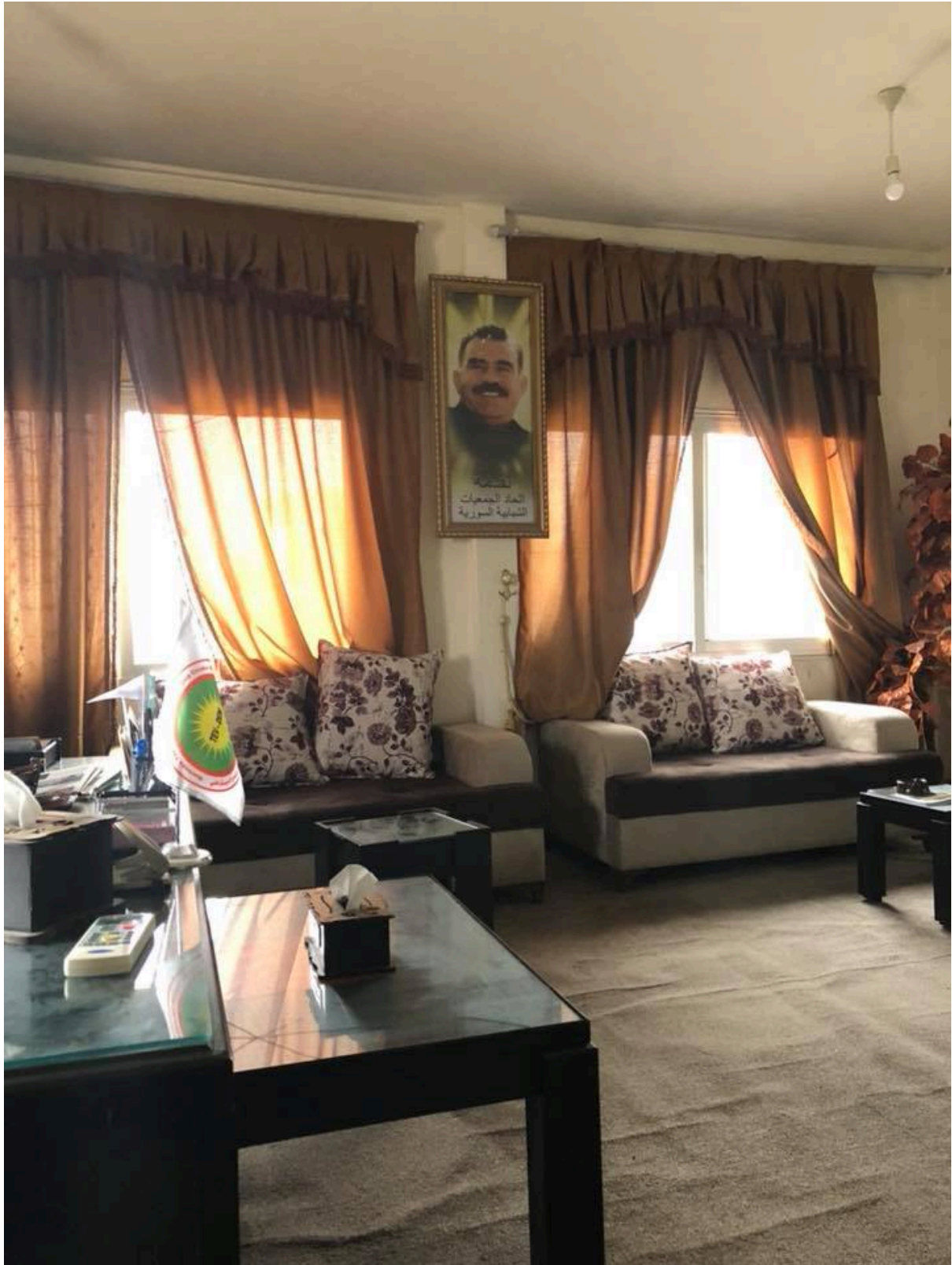
Inside the TEV-DEM public relations office. Note the portrait of Abdullah Ocalan.

There have been elections at the levels of communes and city councils, but general elections for the federal region have not been held yet. In fact, they have been delayed for reasons such as the fact that in certain areas many of the original inhabitants have not yet returned and the environment is