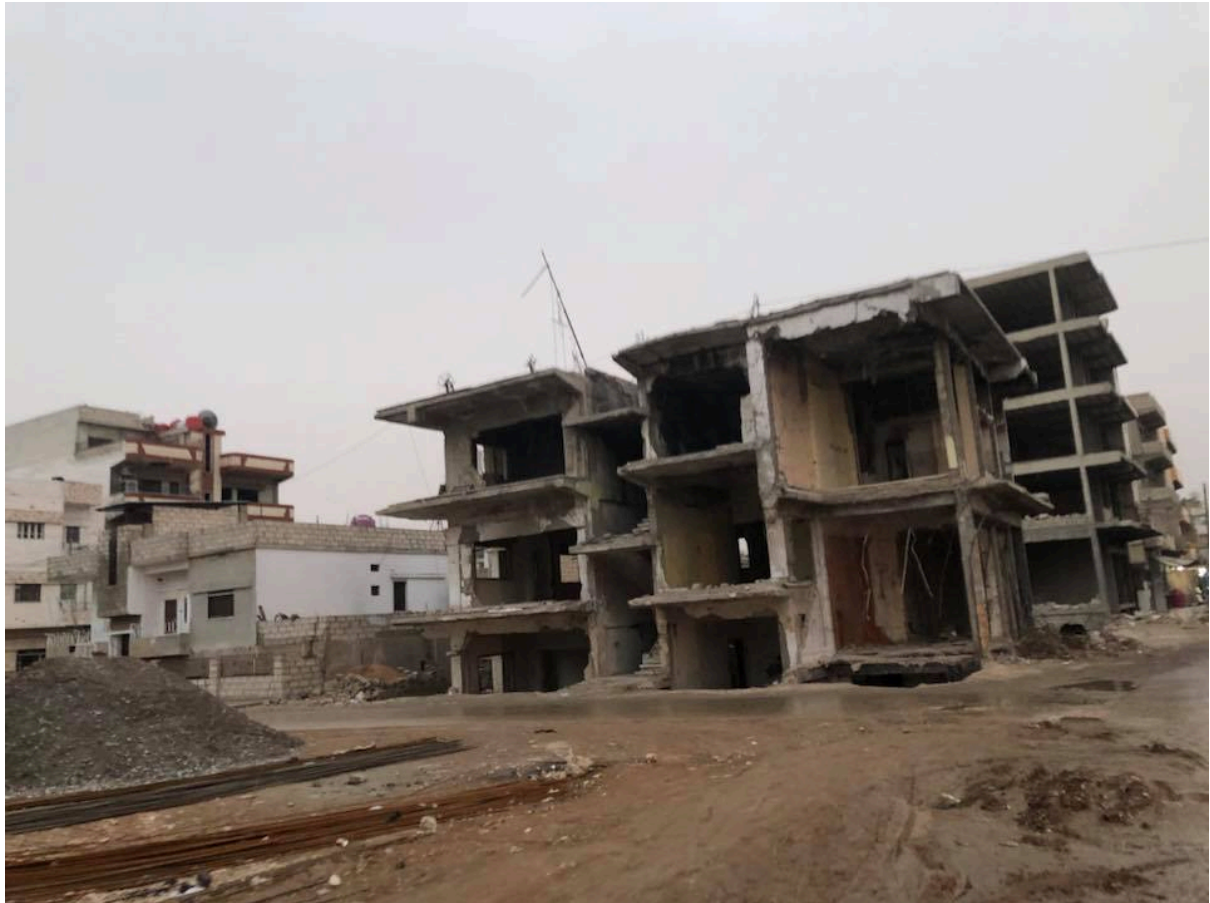
Site of the July 2016 bombing in Qamishli.

The city is largely under the control of the Autonomous Administration, but the regime maintains a notable presence in a section known as the Security Square ( Murabba' Amni ). The Syrian flag and posters and placards featuring Assad's portrait are on display in the area. Traffic policemen affiliated with the Syrian government can also be seen in the area and in proximity to it. In addition, the regime controls Qamishli airport and the road leading to it. Outside the Security Square, a militia called Sootoro that is aligned with the regime can be found in a Christian neighbourhood of the city. It should not be confused with the Sutoro that works with the Asayish (police/internal security apparatus) of the Autonomous Administration and is affiliated with the Syriac Union Party (SUP) and in turn the Bayt Nahrain National Council. The SUP is aligned with the Autonomous Administration. Also under the Bayt Nahrain National Council is the Syriac Military Council, which is part of the SDF and has a base inside Qamishli.