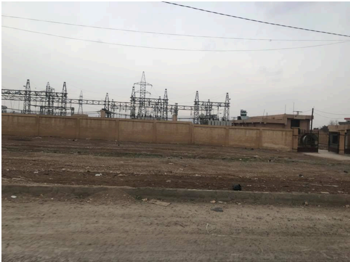
Outside the regime-affiliated electricity station and office in Qamishli

Presently, there is some national grid electricity being supplied to Qamishli, amounting to a total of around 6 hours per day. From 2013 until 2016, the national grid electricity situation for Qamishli was not good. Qamishli's electricity sources have chiefly derived from Deir az-Zor and Raqqa provinces via substations in the Hasakah and Mabrukah areas, as well as the Sweidiya power station. The fact that the rebels and then the Islamic State initially seized most of Deir az-Zor, Raqqa and Hasakah provinces meant that these sources of electricity were lost, and some of the units at the Sweidiya power station, which relies on oil, went out of service.