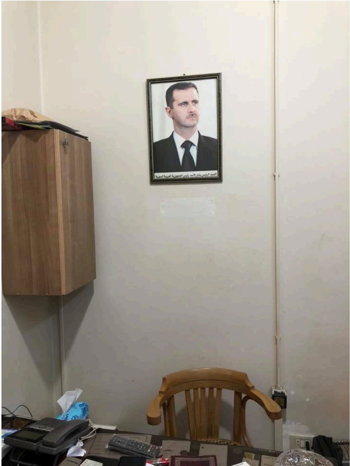
Inside the regime-affiliated electricity office in Qamishli

Improvements to the situation began to come in 2016 with SDF advances against the Islamic State in Raqqa province in particular, as the Islamic State lost the Tishreen Dam in December 2015 and then the Tabqa Dam (Euphrates Dam) in May 2017. xv Some repairs were made to infrastructure that had