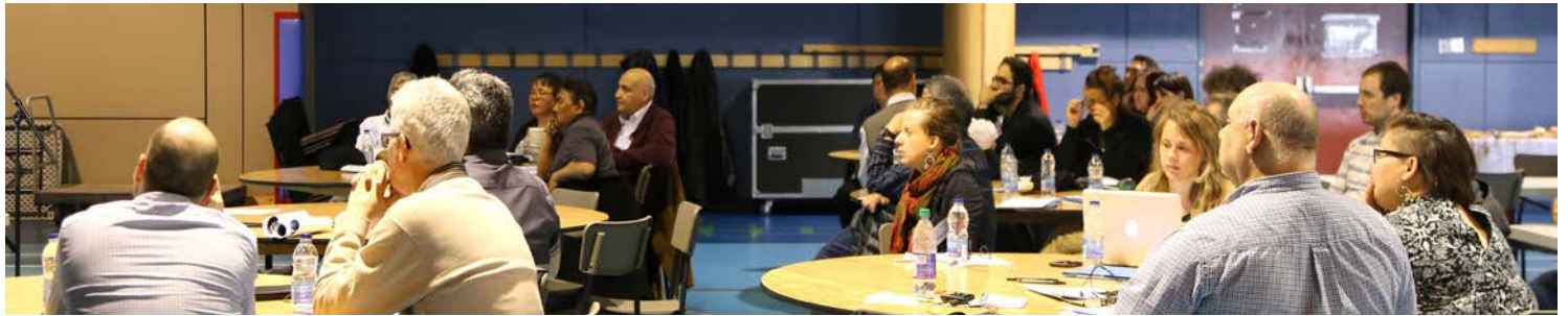
General Assembly in Kuujuaq, June 2016

As a reminder, the Living in Northern Quebec partnership (LINQ) aims to study the culturally appropriate and sustainable living environments of the Innu communities of the Nitassinan and the Inuit communities of Nunavik . It considers these environments by examining the many aspects that give them meaning and guide their development. The collaborative research focuses on three elements: Communities, Living/Built Environments and Governance. You can read our project summary here: in English or in Inuktitut .