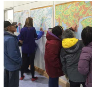
Public consultation in Inukjuak, September 2016

More information about the projects will be available in the coming weeks.