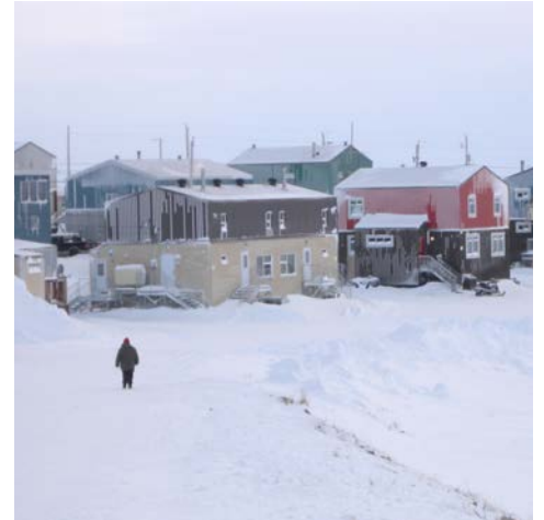
Puvirnituk, January 2017