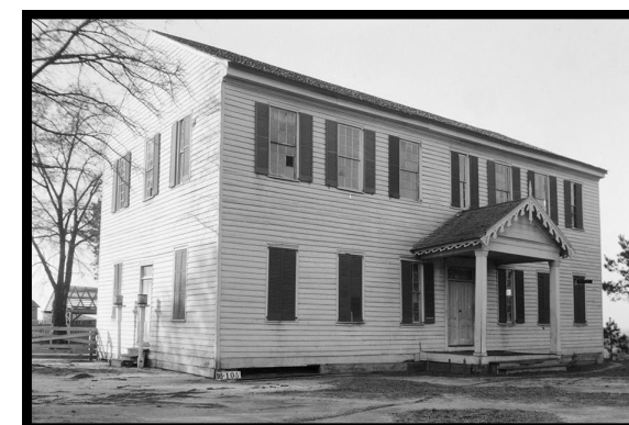
Right: Masonic Hall in 1935.