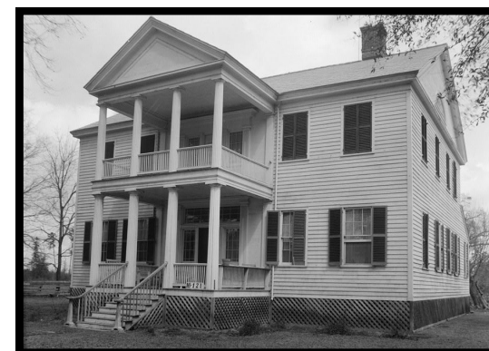
Left: James Dellet house in the 1930's.

The pilgrimage is a joint project of the Museum Endowment Board and the Perdue Hill-Claiborne Historic Preservation Foundation. Ticket information and sales will be available at the Old Courthouse Museum in Monroeville starting in July.