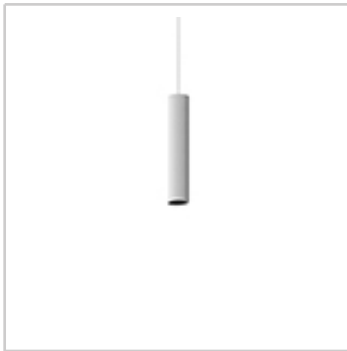
STELO 1S 30 design by Lucitalia