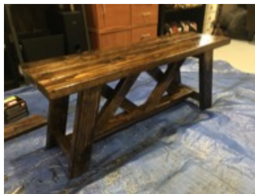
The finished product! Ephesians 2:10