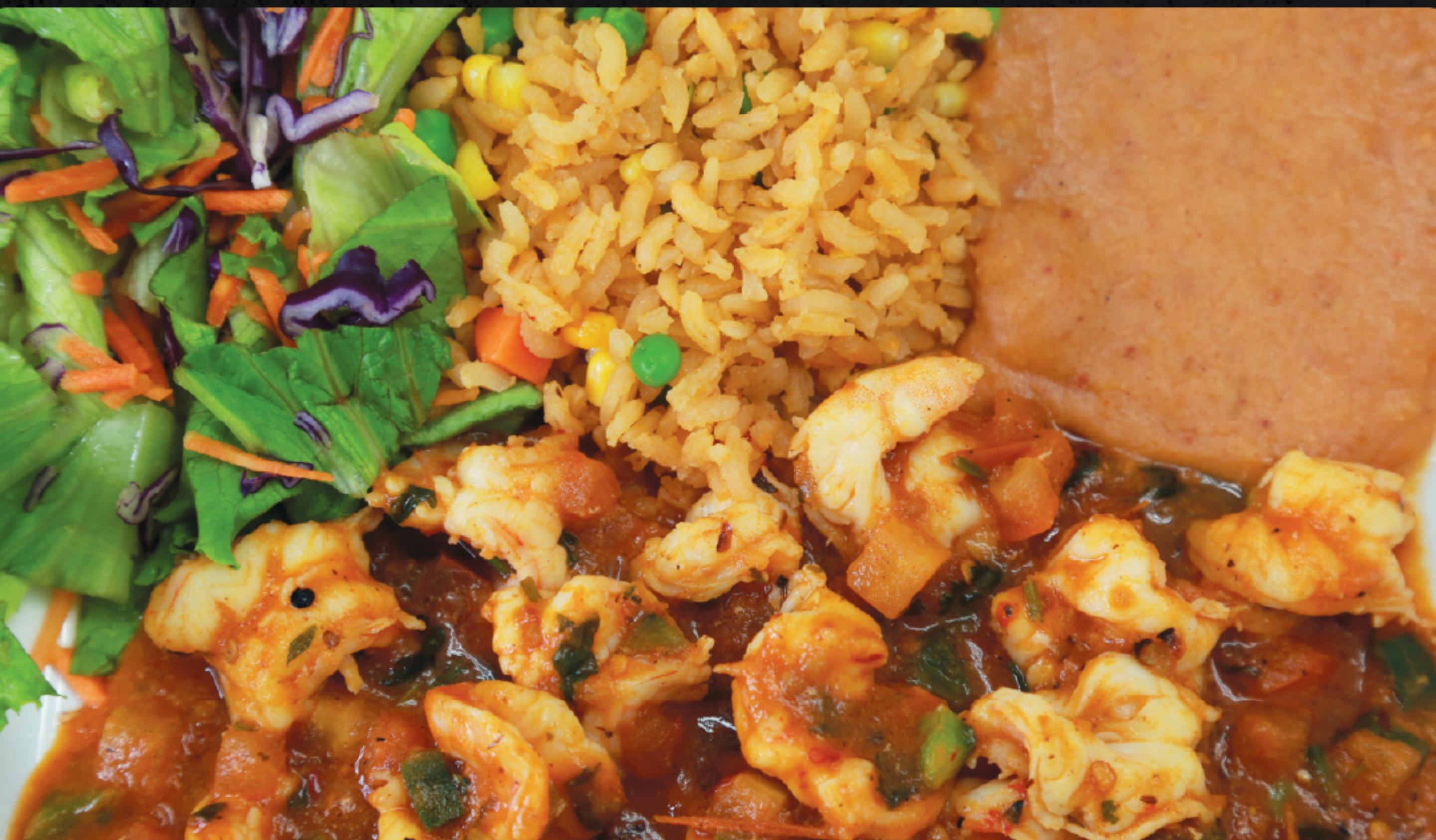
RANCHEROS SHRIMP 18