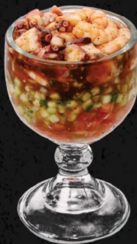
SHRIMP AND OCTOPUS COCKTAIL 20