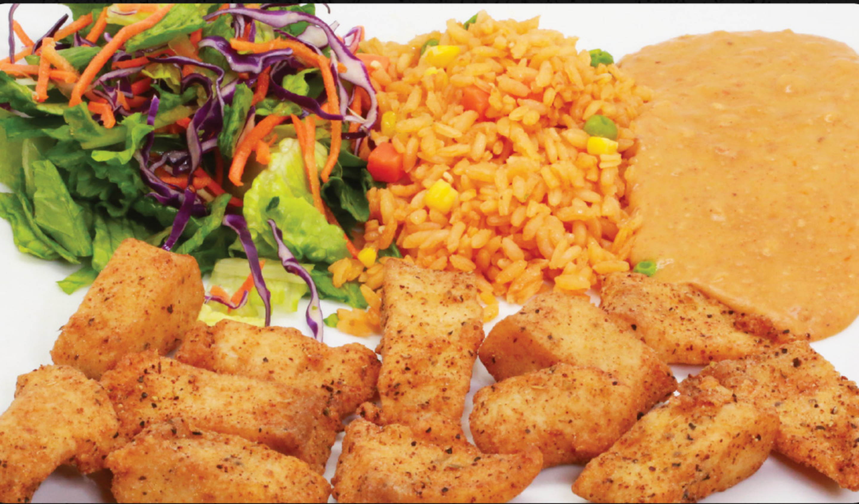
FISH CRACKLINGS 15