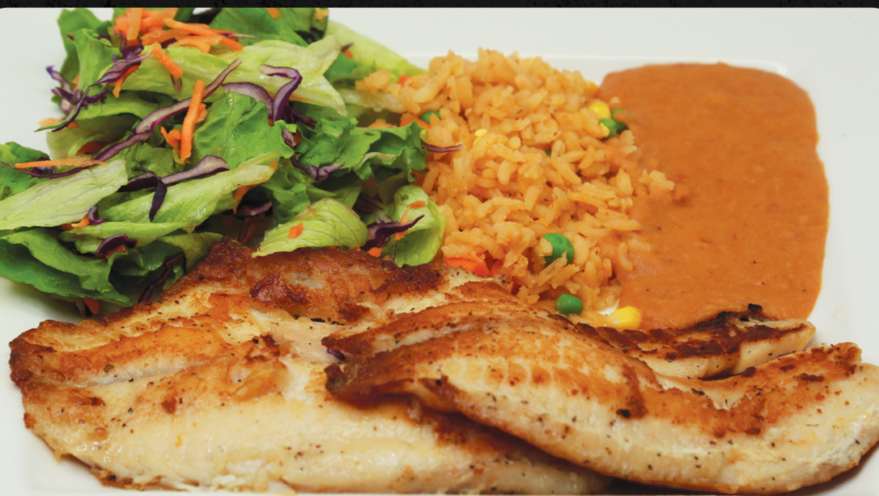
GRILLED FISH FILLET 14