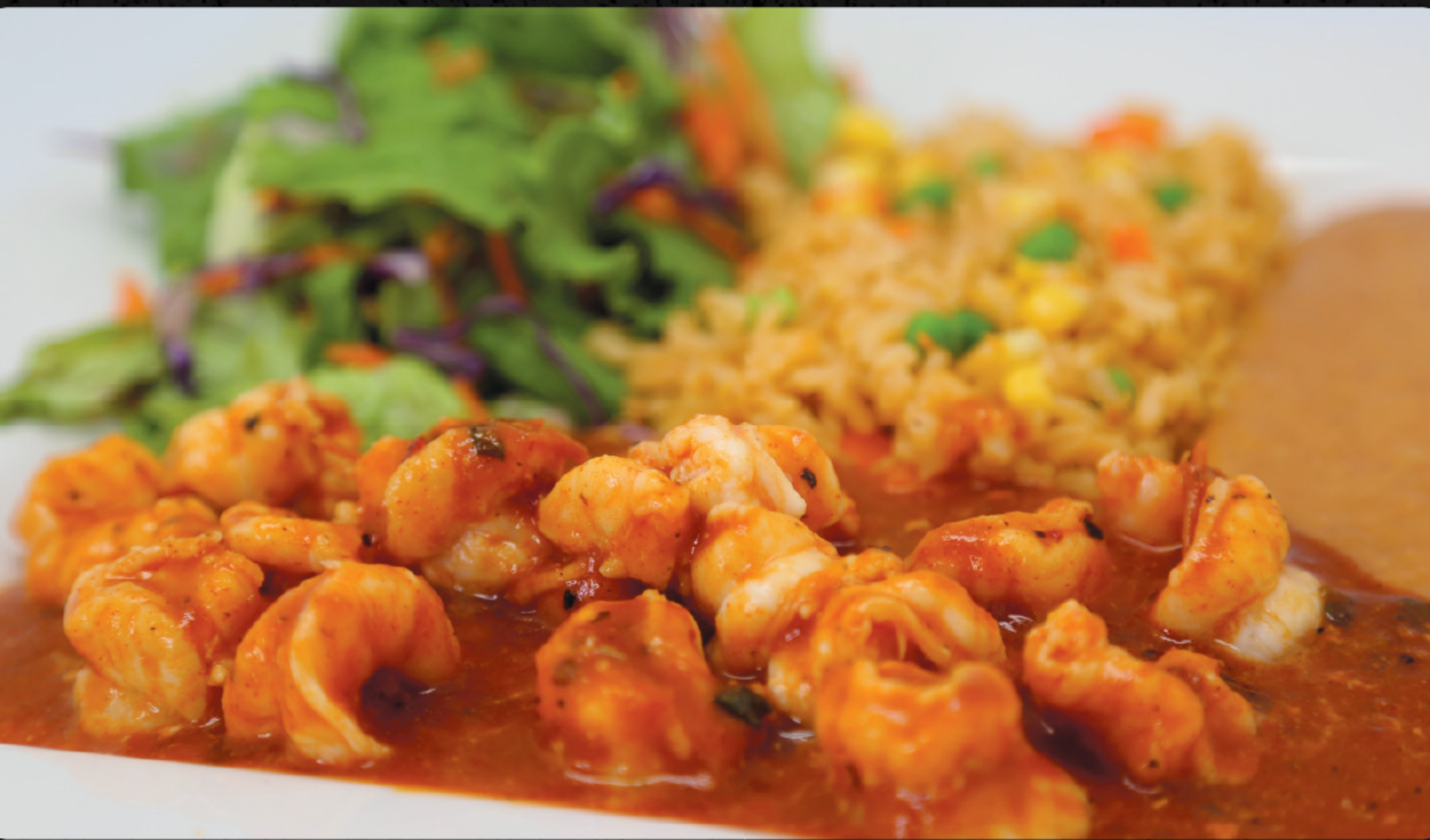
DEVIL SHRIMP 18