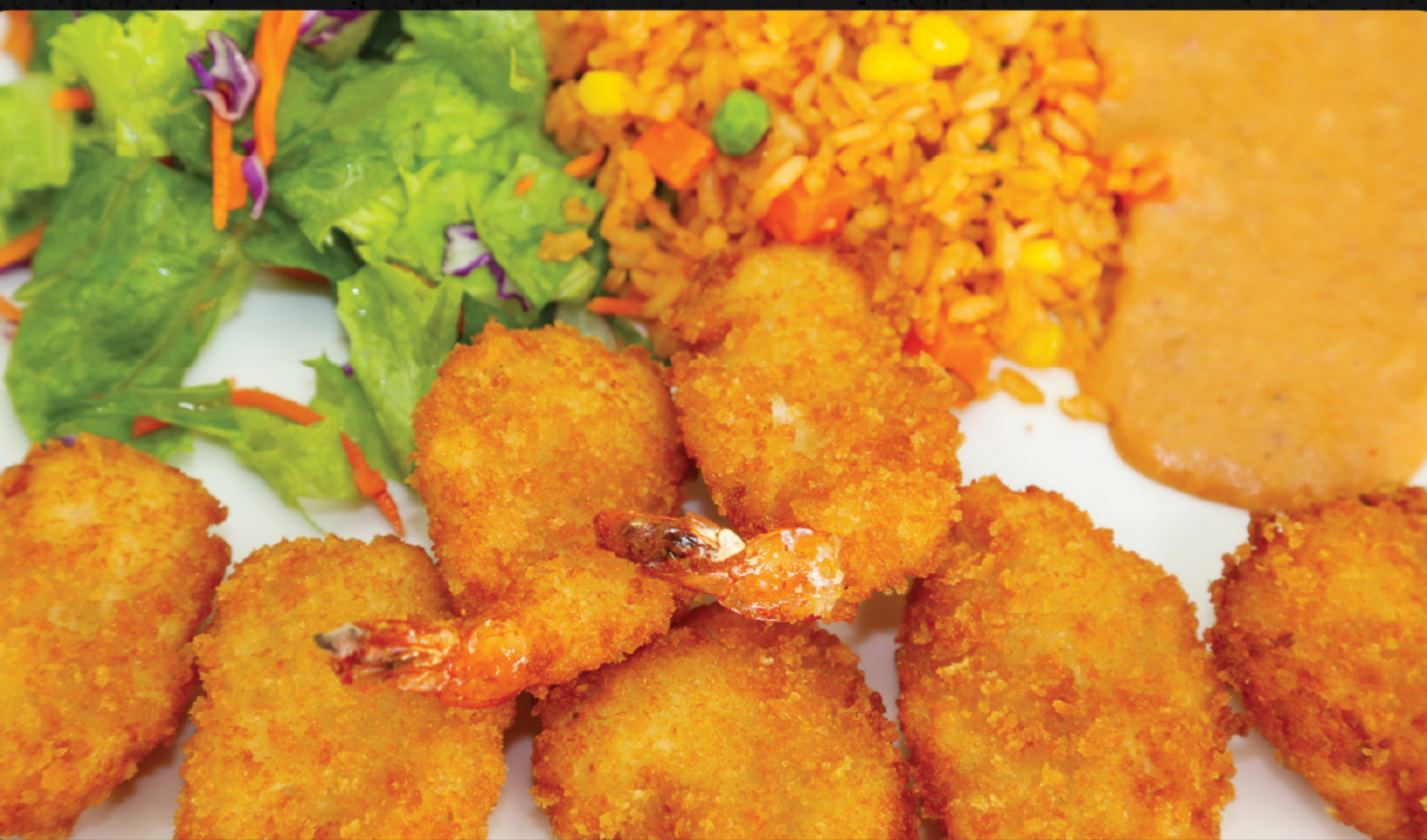
BREADED SHRIMP 18