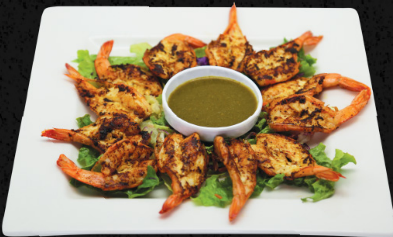
ZARANDEADOS SHRIMPS Cooked shrimp in a spicy mild salsa. Served on salad. 22