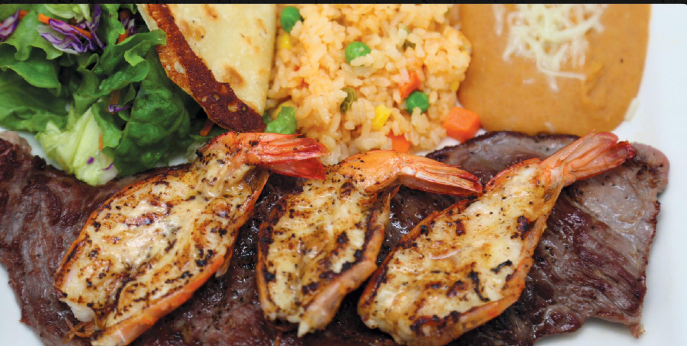
STEAK AND ZARANDEADO SHRIMPS 20