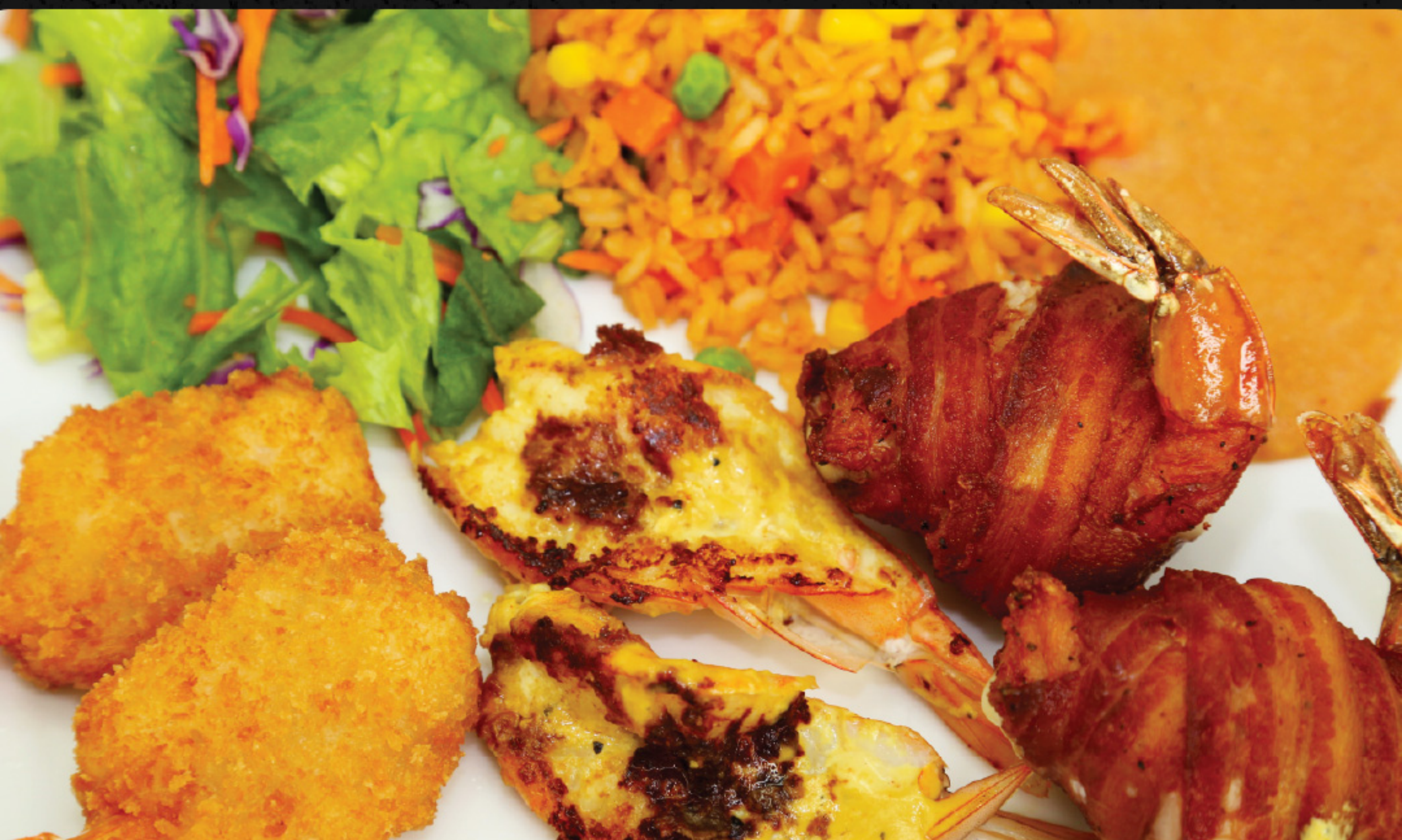
SHRIMP MIX 18