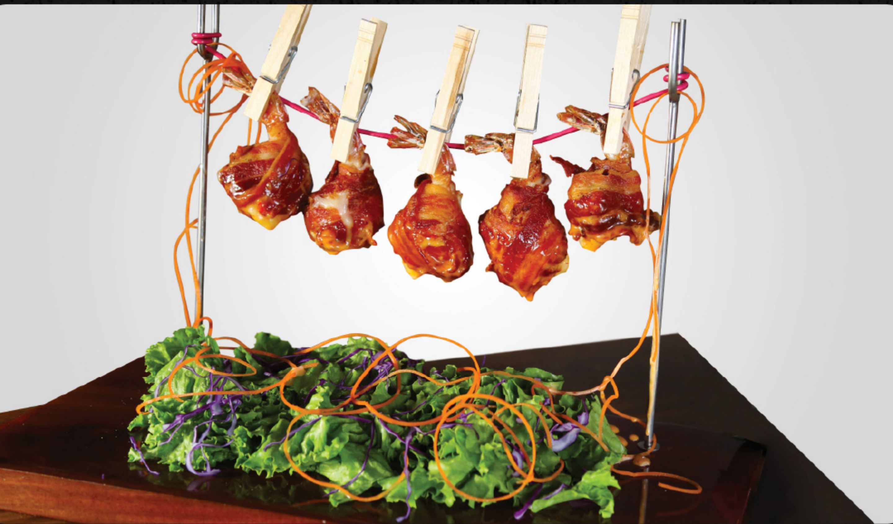
BLUE COAST SHRIMP 19