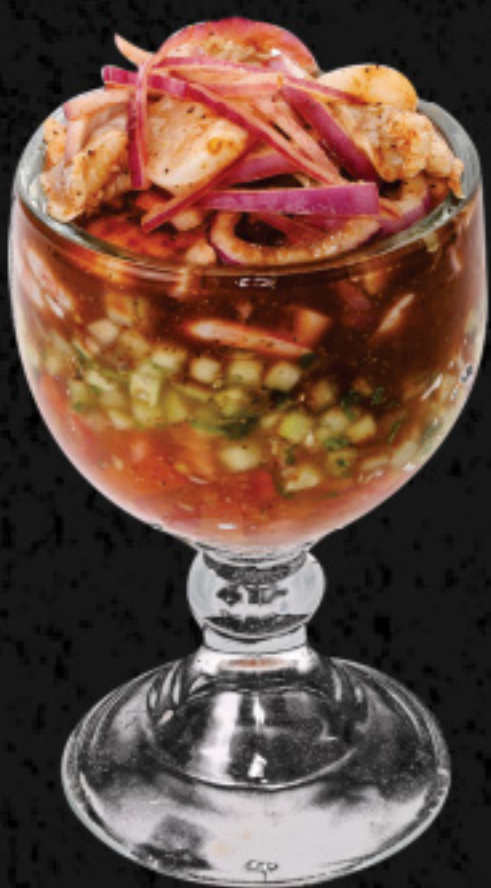
CAMPECHANA* Cooked shrimp, octopus, scallops and shrimp cooked in lime juice. 24