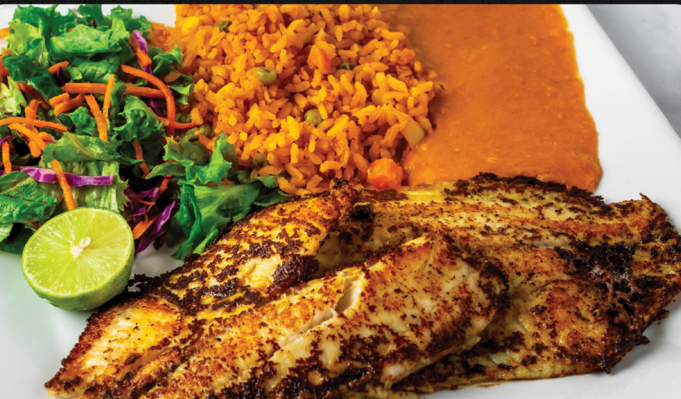
ZARANDEADO FISH FILLET 16