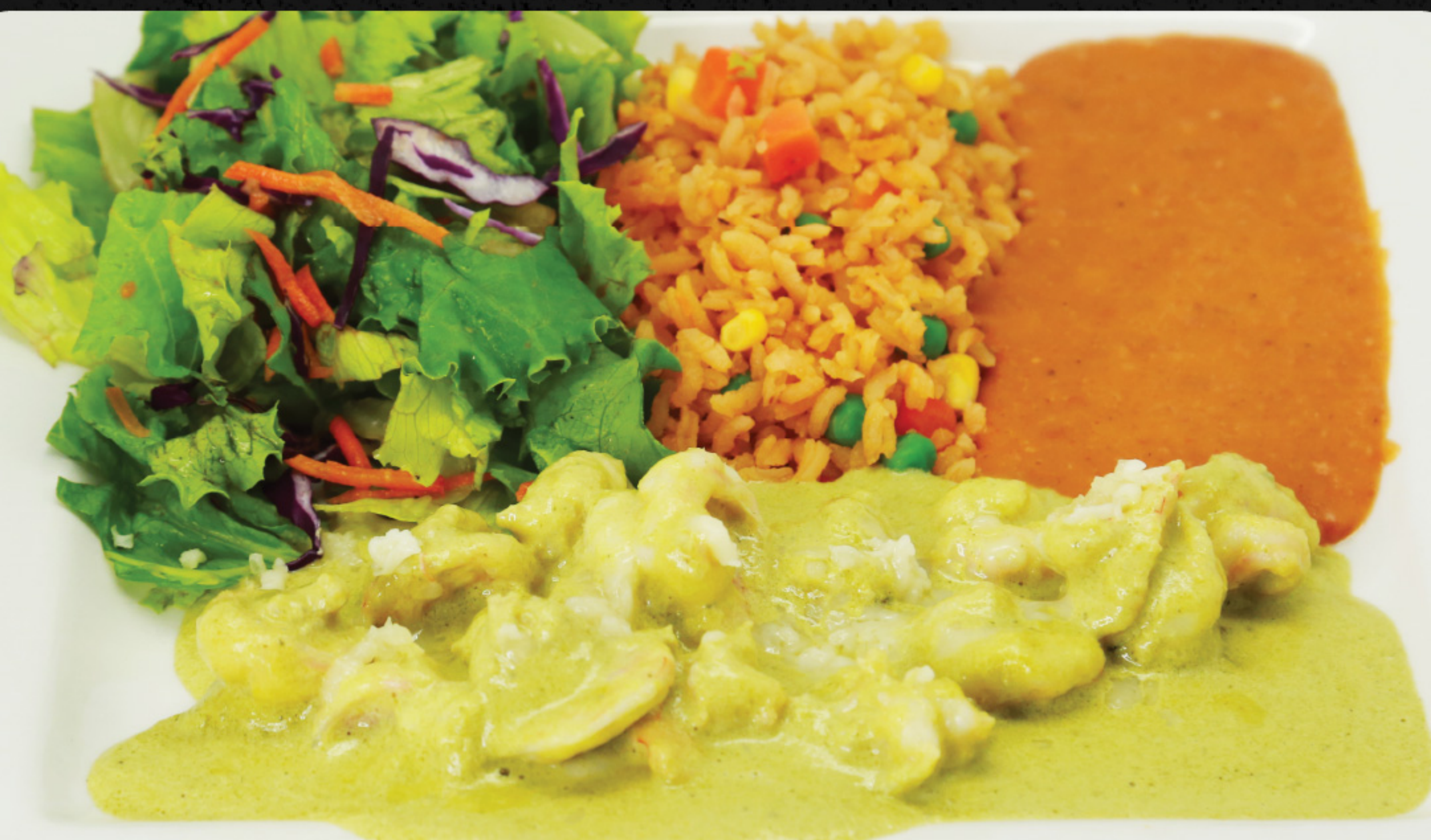
CULICHI SHRIMP 18