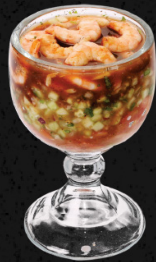
SHRIMP COCKTAIL 18