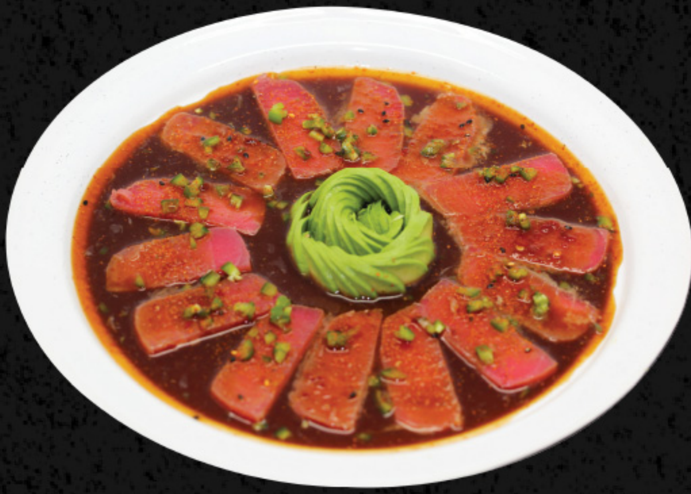
TUNA SASHIMI* 22