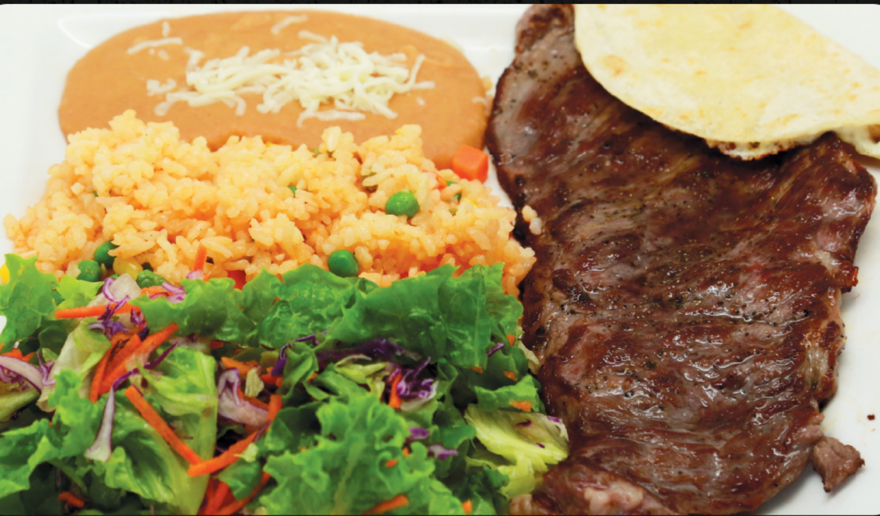
GRILLED STEAK 19