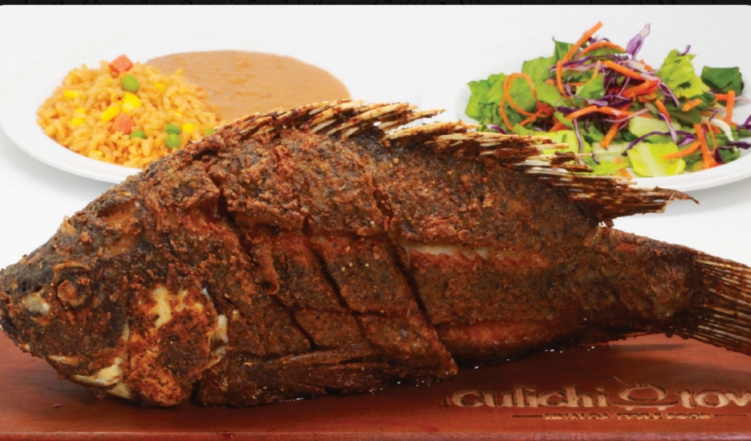
FRIED FISH 15